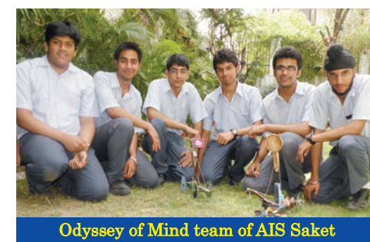
Odyssey of Mind team of AIS Saket

Each team chose one problem and spend approximately 6 months designing, testing and improving upon a solution, simultaneously practicing for a spontaneous problem.