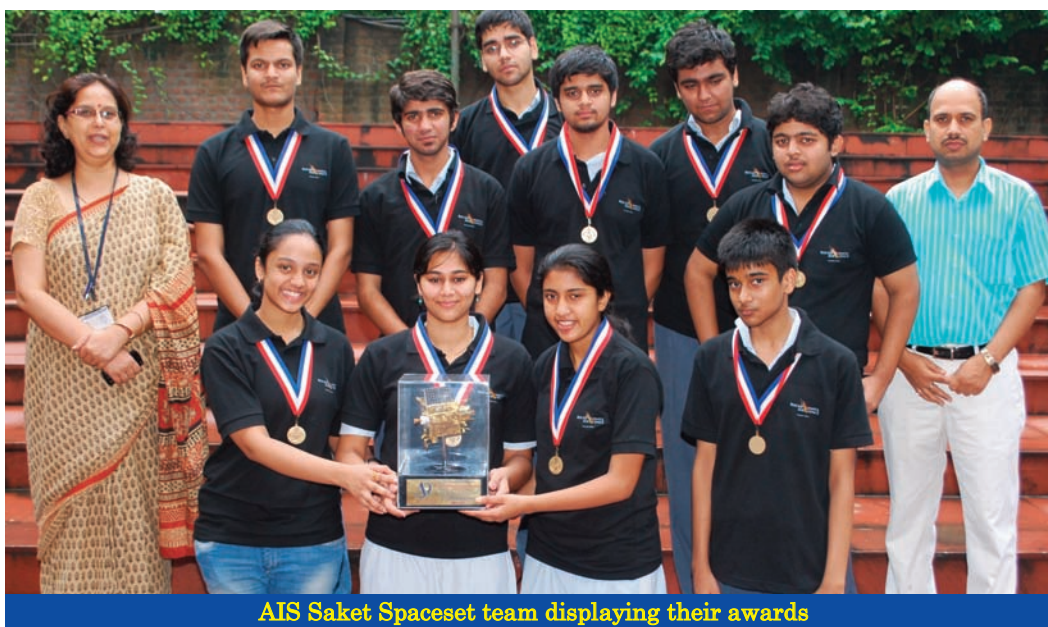
AIS Saket Spaceset team displaying their awards

Seven students of Amity International Schools participated in the third International Conference, YRoNS held at Cyprus. YRoNS - An International Science conference was introduced in the year 2007 with the view of encouraging and motivating students to take keen interest in the field of science and also as a platform to meet,