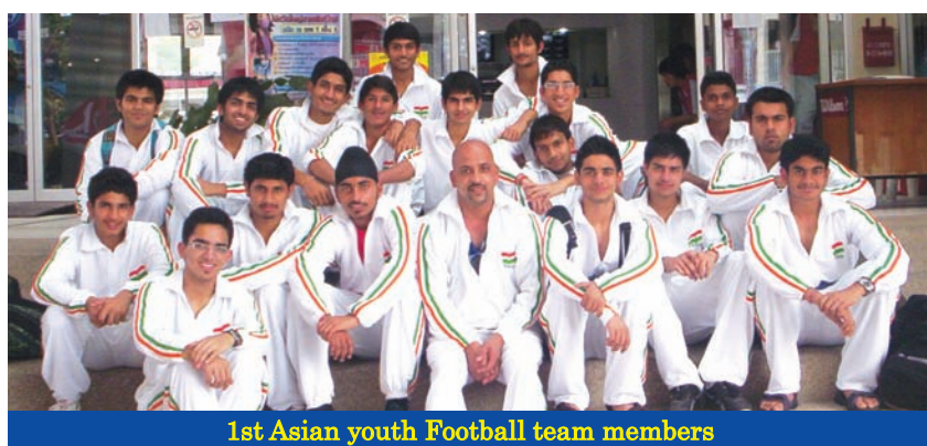
1st Asian youth Football team members