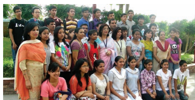
Students during SAARC Exchange Programme