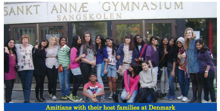
Amitians with their host families at Denmark