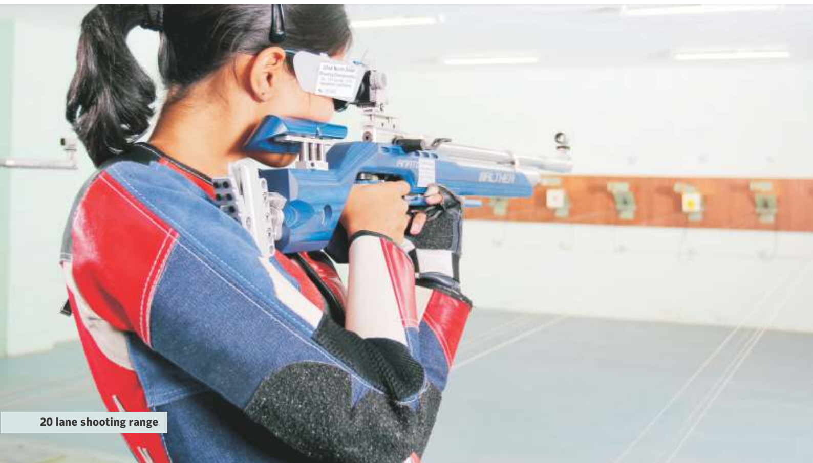
20 lane shooting range

“Amity's world class shooting range honed my latent talent and helped me win a silver medal in UP State Shooting Championship.”