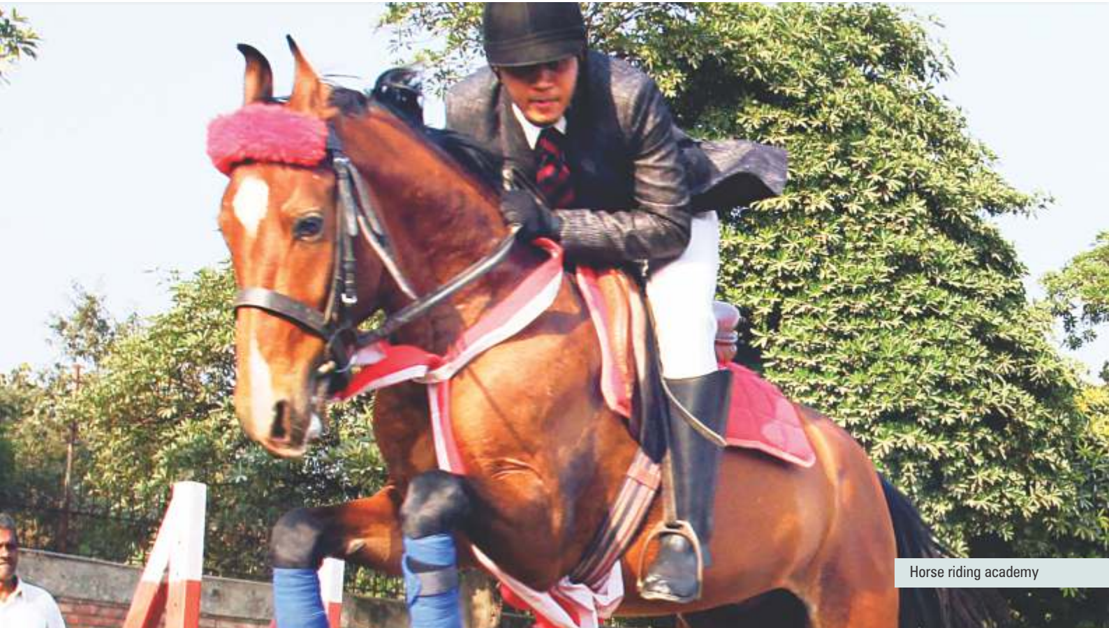
Horse riding academy