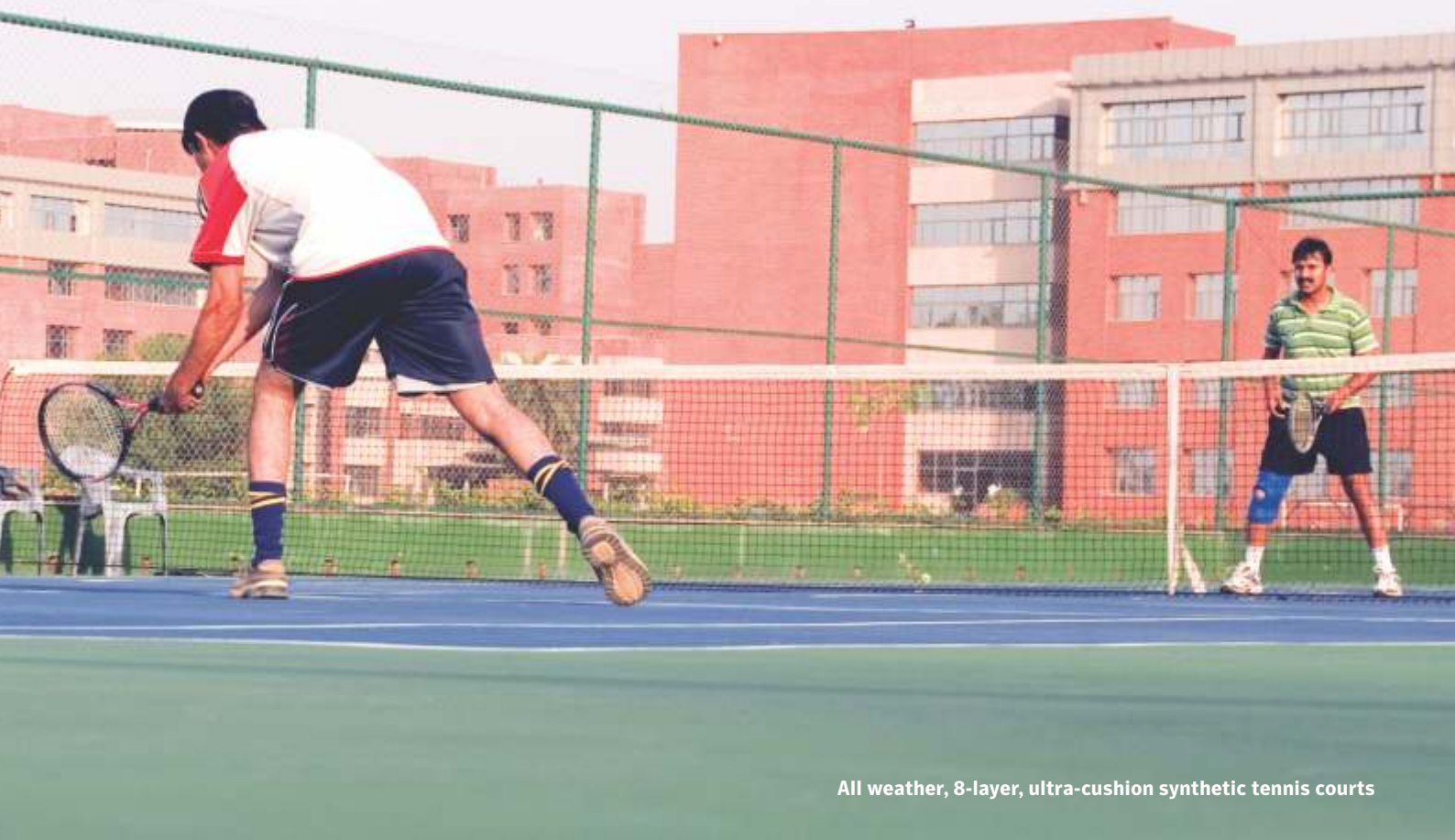
All weather, 8-layer, ultra-cushion synthetic tennis courts