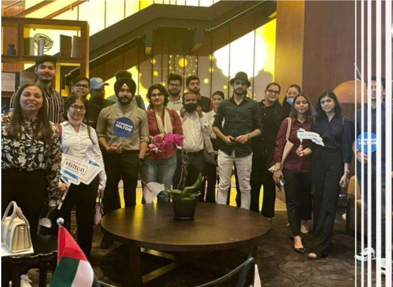
VISIT TO HILTON HOTEL DUBAI