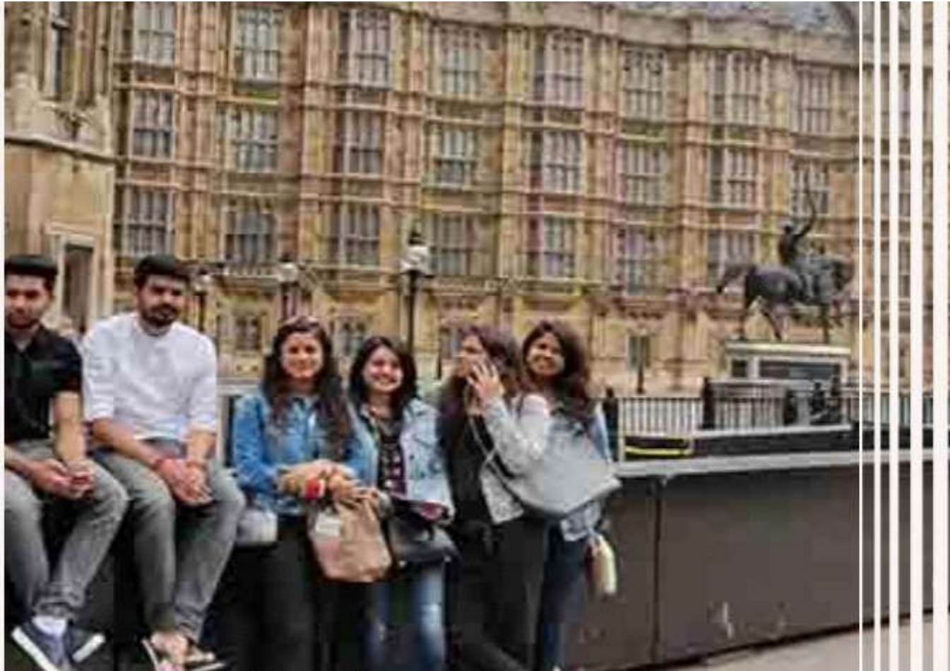
VISIT TO HOUSE OF PARLIAMENT & BIG BEN LONDON