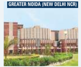
GREATER NOIDA (NEW DELHI NCR)