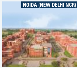
NOIDA (NEW DELHI NCR)