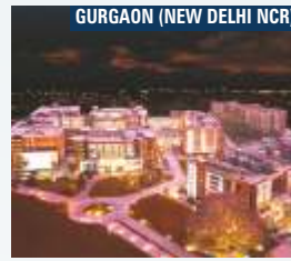
GURGAON (NEW DELHI NCR)