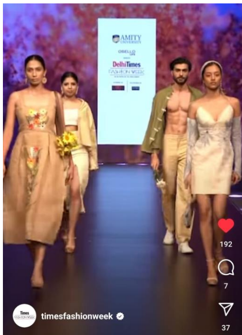
Collection -3 Sustainable (ASFT, AUH)