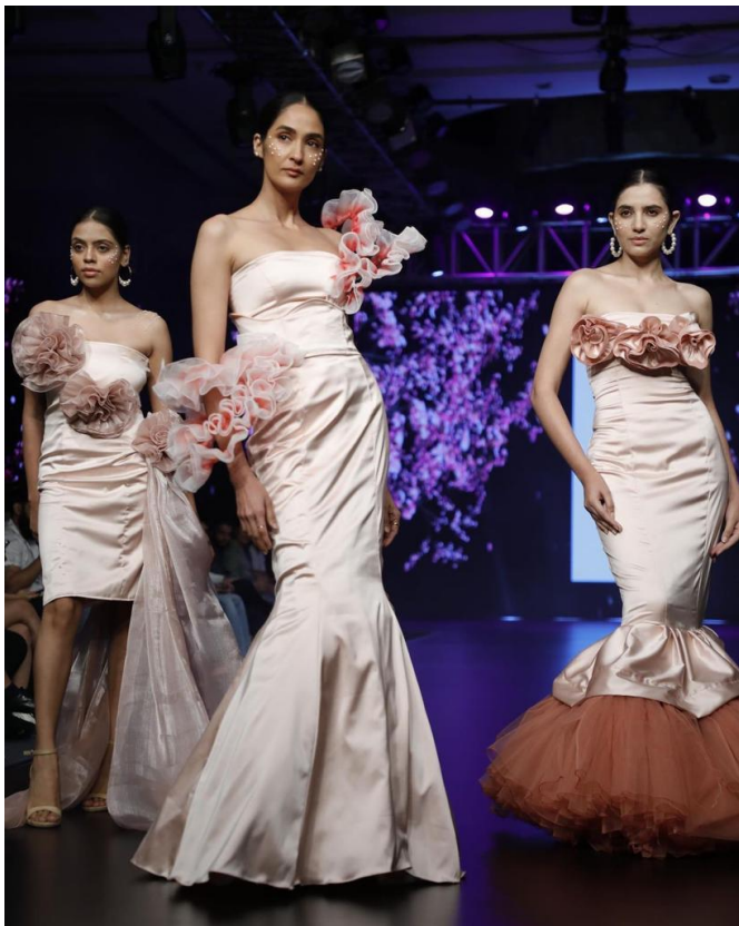
Collection 1- Colossal carnation (ASFT, Noida)