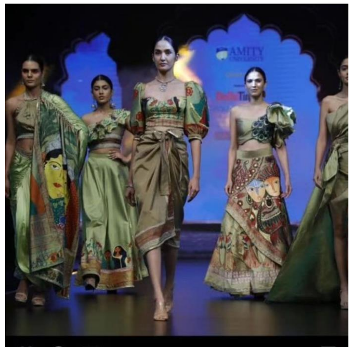
Collection -4 Shades of India (ASFT, Noida &AUH)