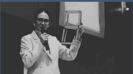
Architecture and Planning sessions nurturing spatial thinking and practical skills.