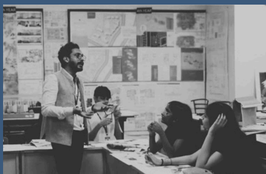
Hands-on sessions nurturing creativity and design thinking in young minds.