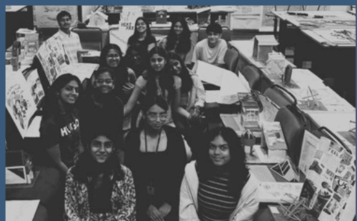
Creative minds expressed their ideas through space, form, and detail.