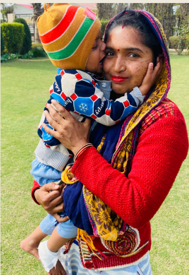
Migrant labor having a lovely time with her child on field