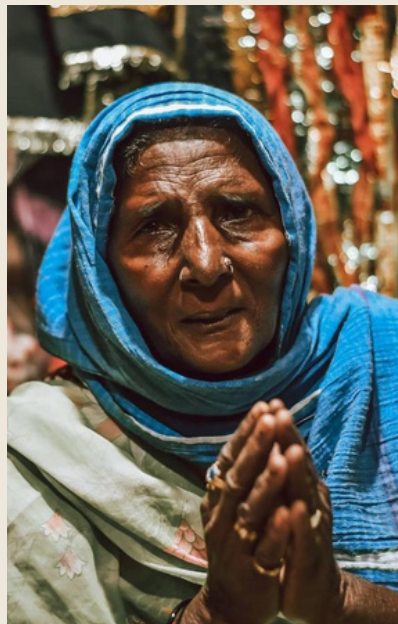
A lady who was kicked off from her own house by her children but thankfully later she was rescued by an NGO