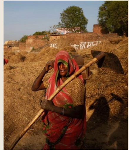
She takes care of her granddaughters as their parents are no more alive