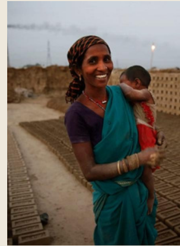
Aa women playing with her kid after finishing her working hours Being tired but still, she chose her child over anything