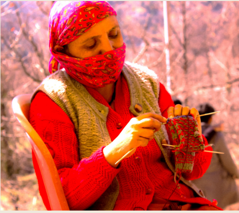
Mountain lady knitting for her family as she sits in her tea stall