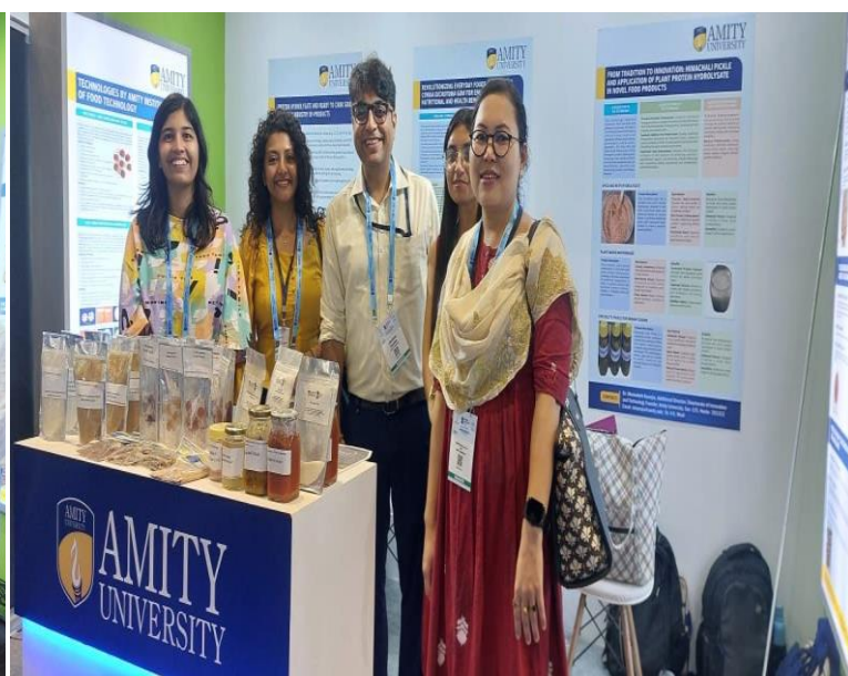
Exhibition Stall of AIHSR at Global Bio India 2024