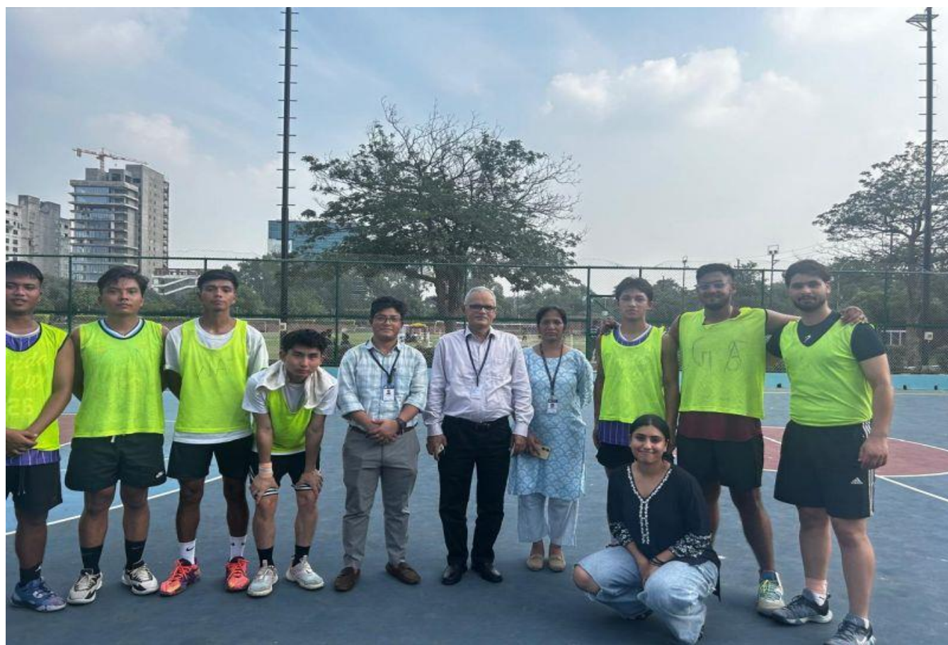
AIHSR Student Participation at Sangathan 2024