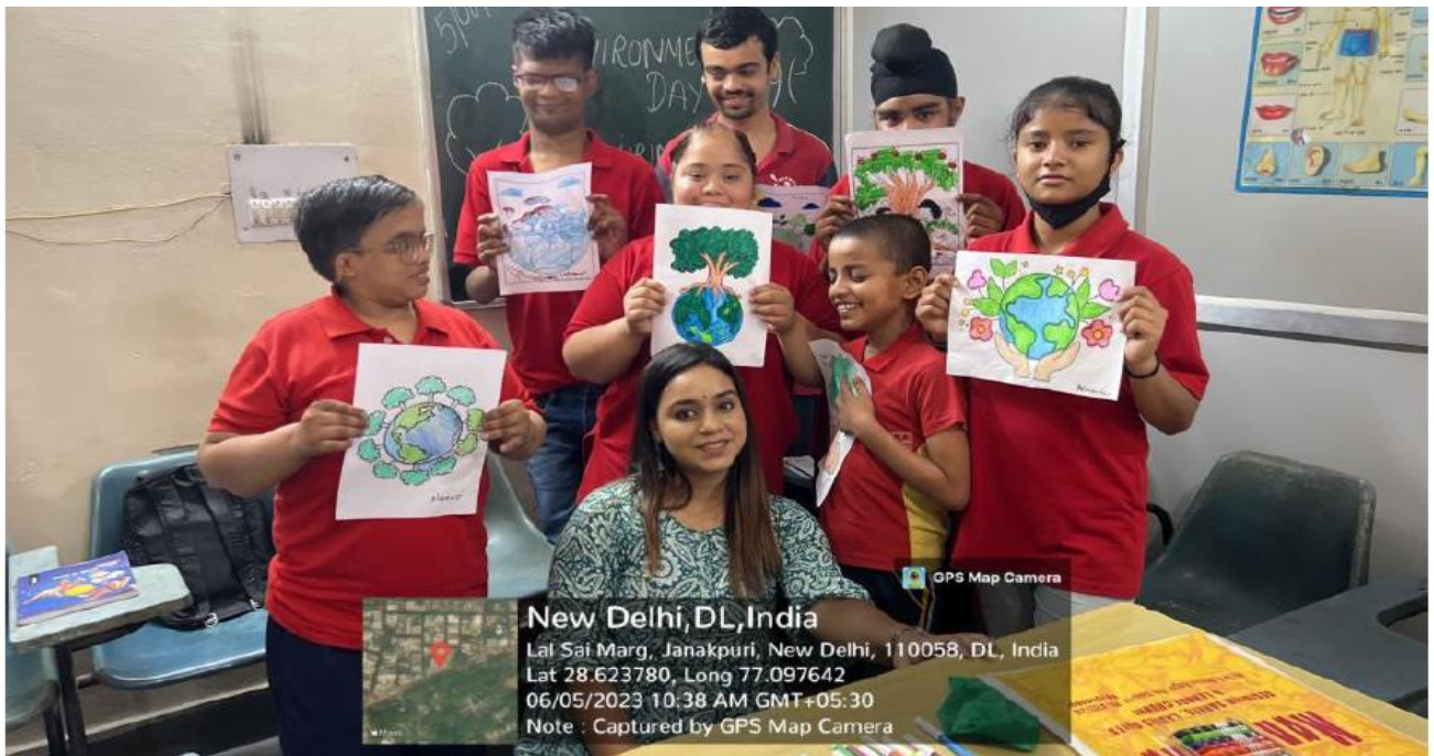
New Delhi, DL, India Lal Sai Marg, Janakpuri, New Delhi, 110058, DL, India Lat 28.623780, Long 77.097642 06/05/2023 10:38 AM GMT+05:30 Note : Captured by GPS Map Camera