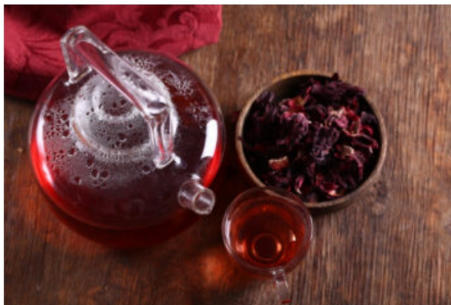
Hibiscus sabdariffa is frequently used in teas and juices.