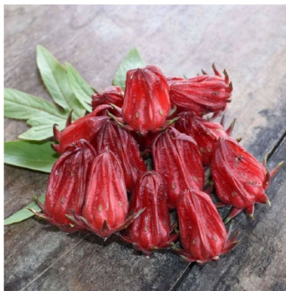
Roselle calyx extract contains bioactive compounds, such as antioxidants, flavonoids, betaine and hibiscus acid.