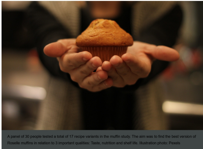
A panel of 30 people tested a total of 17 recipe variants in the muffin study. The aim was to find the best version of Roselle muffins in relation to 3 important qualities: Taste, nutrition and shelf life.

Developed by Amity Food and Agriculture Foundation Amity University Uttar Pradesh, Noida