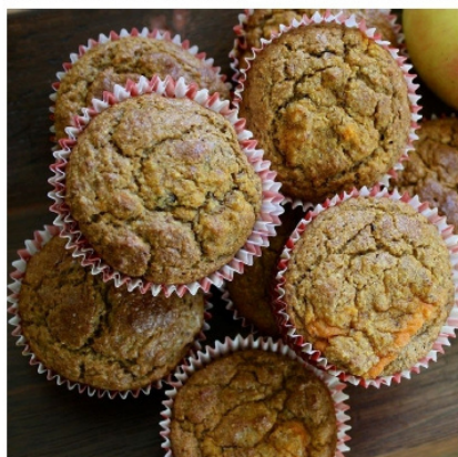
The researchers created a muffin containing Roselle calyx extract that had nutritional benefits.

The study is part of Re-FOOD, a Norwegian-Indian collaborative project that focuses on using and enhancing the value of the left-over raw materials from food processing. The results have been published in Foods .