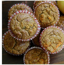
The researchers created a muffin containing Roselle calyx extract that had nutritional benefits.

The study is part of Re-FOOD, a Norwegian-Indian collaborative project that focuses on using and enhancing the value of the left-over raw materials from food processing. The results have been published in Foods .