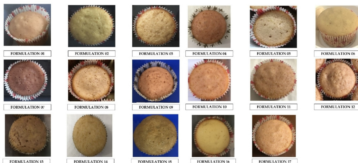
Figure 1. Images of Roselle muffin obtained with different formulations combinations.

This quadratic relationship was observed between the sensory responses and the extract volume, citric acid, and sodium bicarbonate.