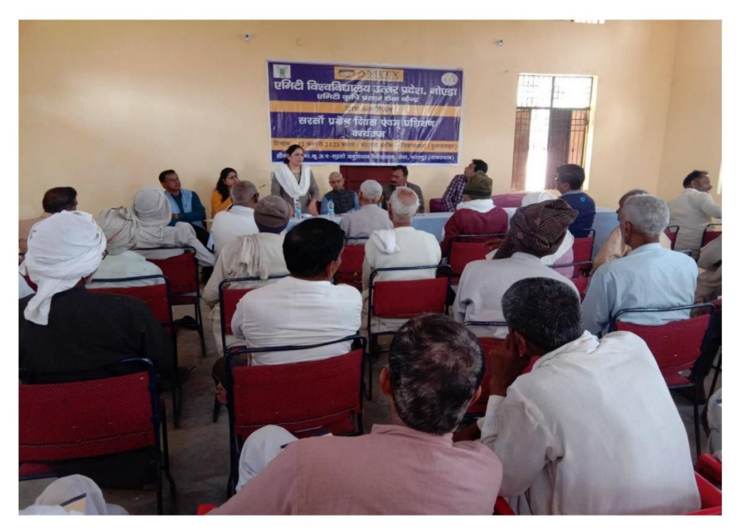
Training programme on Mustard at village Mandawarh, Sikandrabad, Bulandshahr