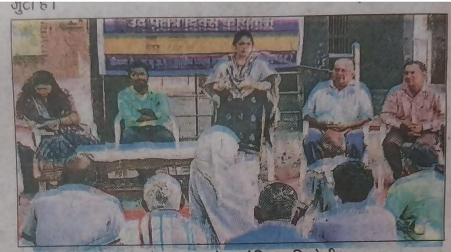
सिकंदराबाद के गांव सलेमपुर जाट में आयोजित कृषि गोष्टी।