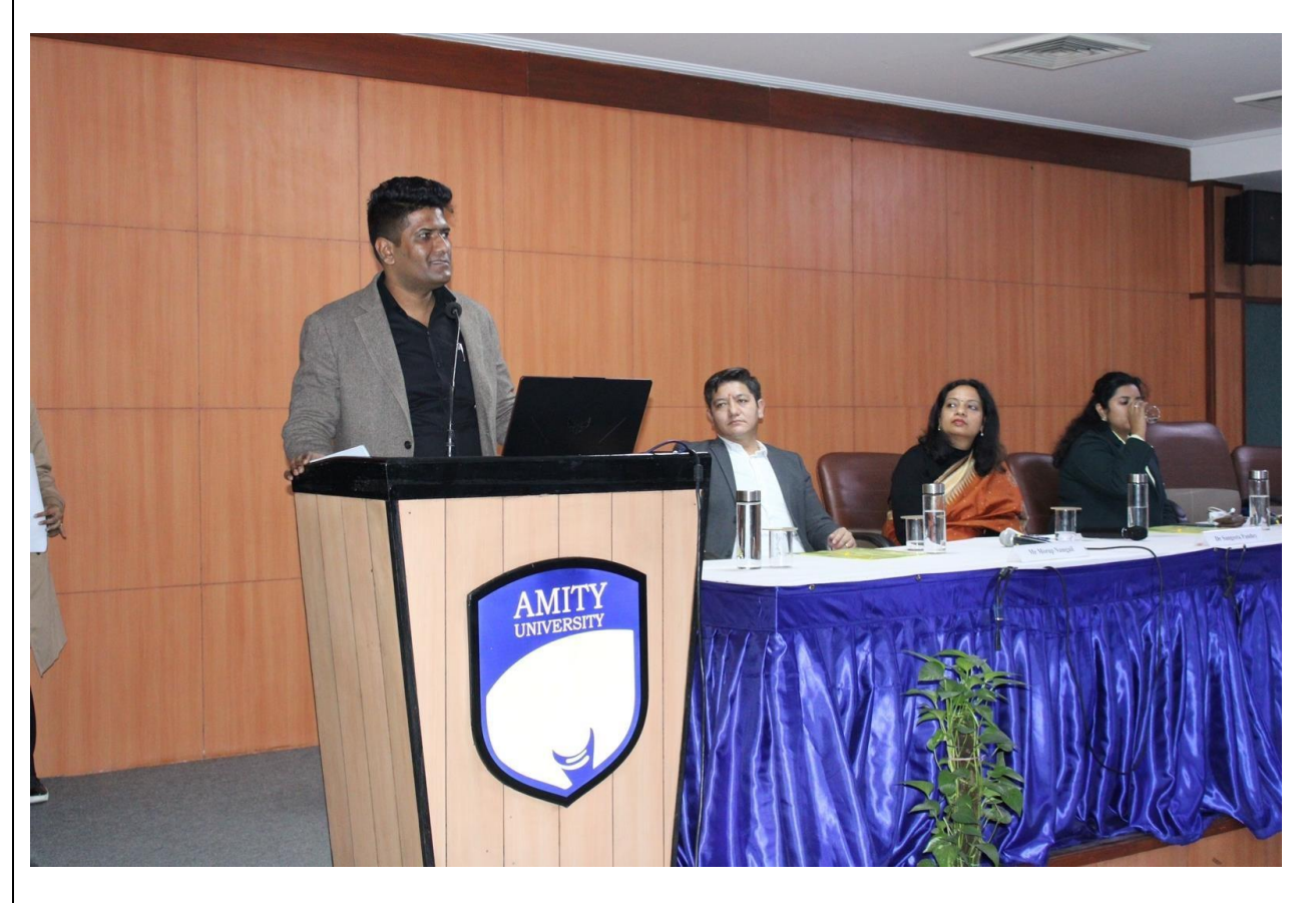
Session – II 4:00 – 4:30 PM