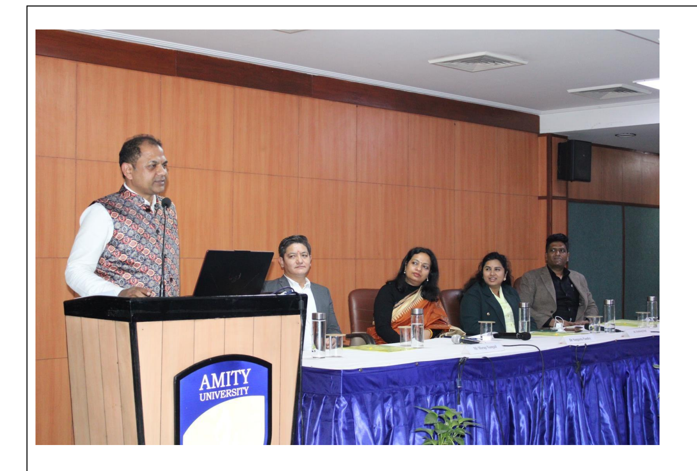
Poster Competition "KALAKRITI"- Students of AIOA

Post the conclusion of both the sessions, a poster presentation competition was held where the esteemed delegates were requested to rate the displayed posters on a 20 pointer scale. The students while presenting their individual posters explained about the theme to engross the interaction. The delegates also took the moment to question the competitors on their posters and awarded marks on three factors: creativity, relevance and correctness.