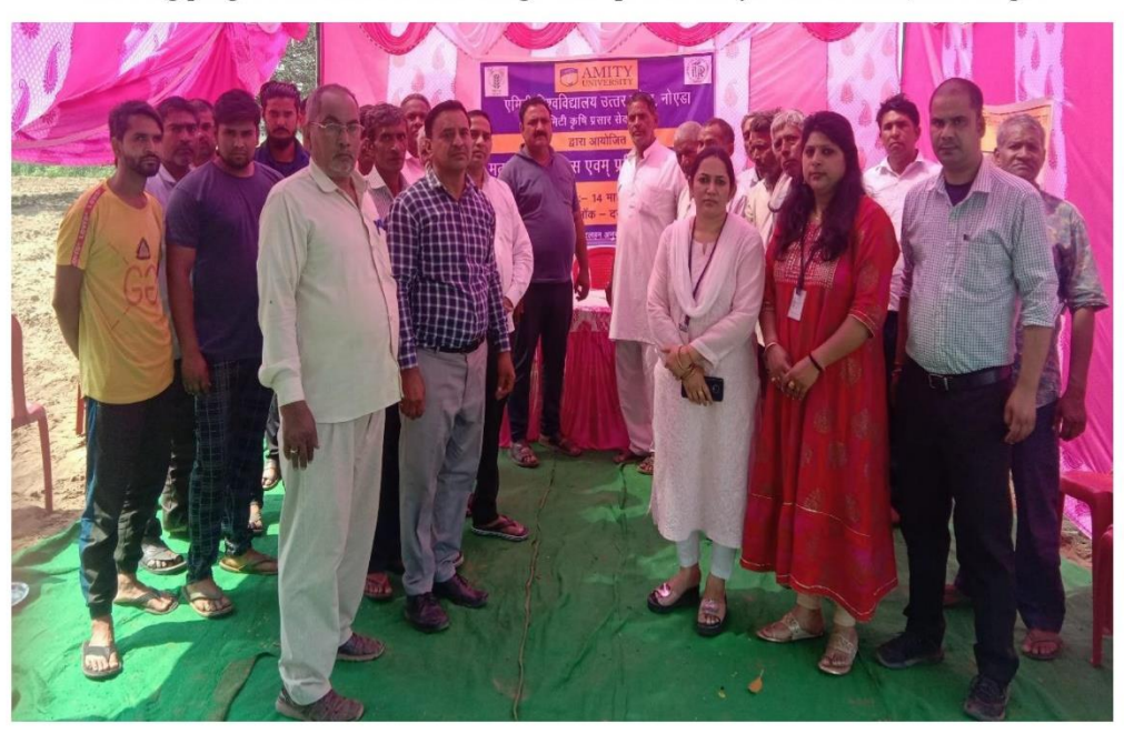
Training programme on Barely at village Jamalpur block Jewar, G B Nagar