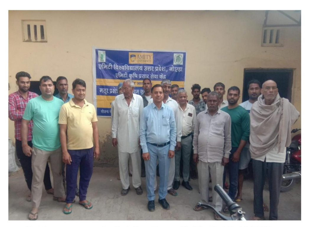
Training programme on Lentil at village Noor pur Madhiya block Dadri, G B Nagar