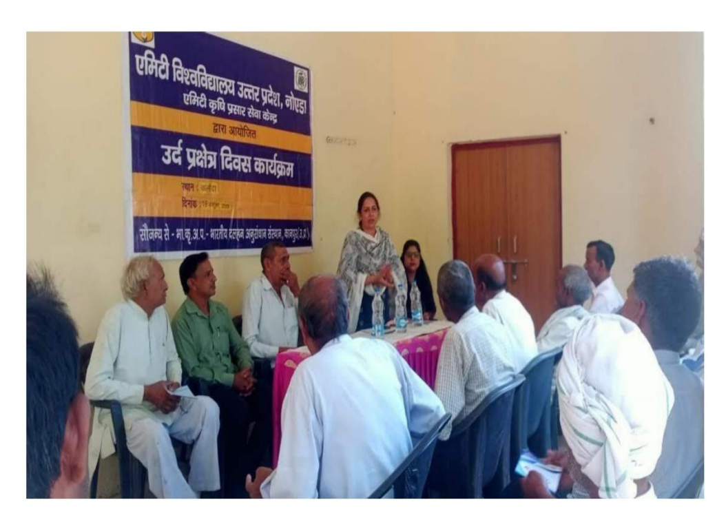
Training programme on Urad bean at village Kalonda block Dadri, G B Nagar