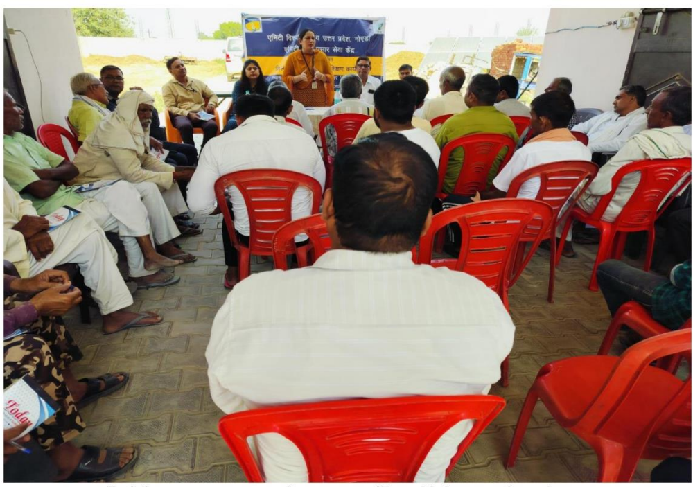
Training programme on Sesame at village Mohammadpur, Jewar