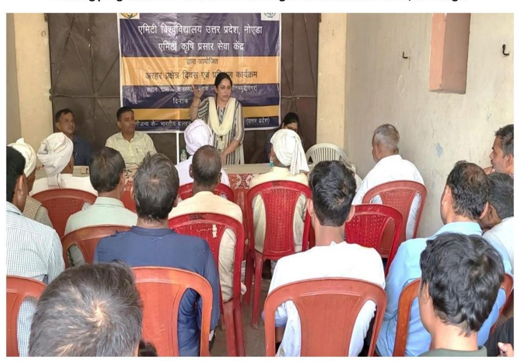
Training programme on Pigeon Pea at village Kanarsa block Dankaur, G B Nagar