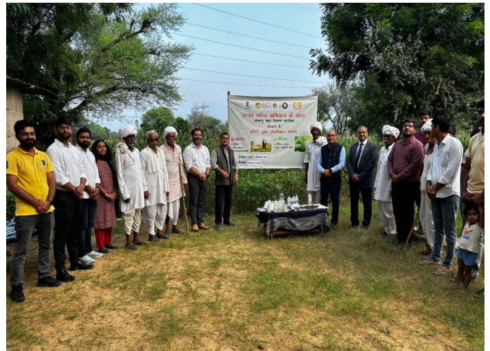
Distribution of biofertilizer to local farmers