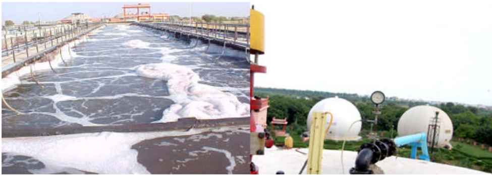
View of Aeration Tank & Power Generation unit & Gas Holding Tanks 62.50 MLD STP DELAWAS

Among the various activities for the students, the industrial visit is definitely one of the biggest and best things that happen. As the main aim of Amity university is to go beyond academics in all possible ways, these visits have always offered insights to students about the practical applications of their theoretical knowledge.