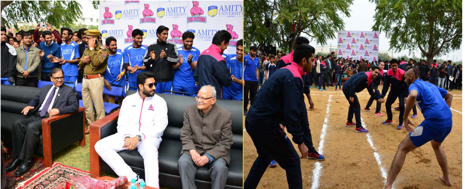
Mr. Abhishek Bachchan and his Pink Panther team along with the Vice Chancellor and Pro Vice Chancellor