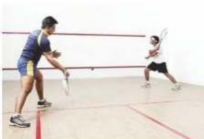
Squash courts built to international standards