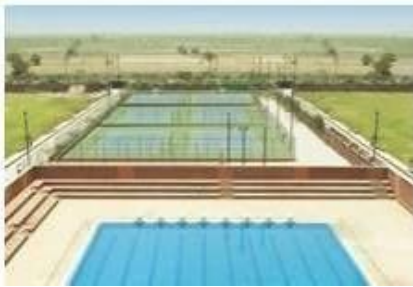
A view of the 15-acre sports complex at Amity Campus