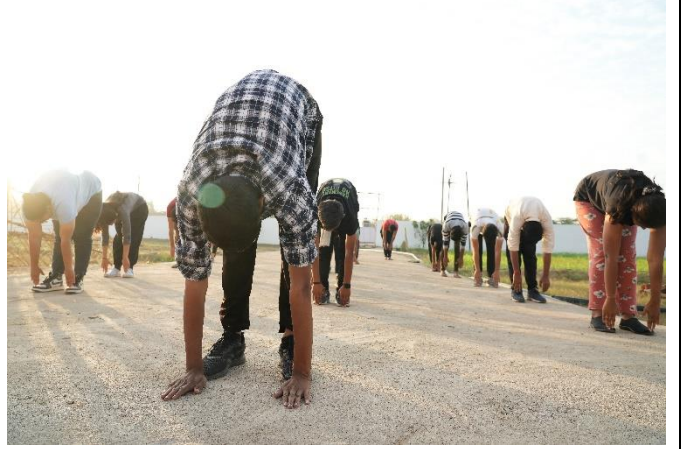
Regular routine of NSS Volunteers in the camp