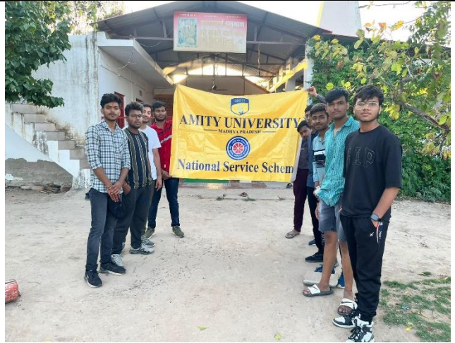
Inspection visit of Nodal Center Officers, Sight Seeing visit to hanuman Temple for donation of labor