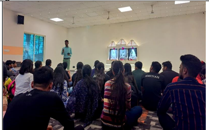
NSS Volunteers of AUMP in Meditation Center, Sharda Balgram, Gwalior