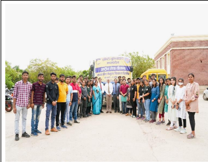
Honorable Vice Chancellor, AUMP flagging off the camping troop on 30.3.2-23