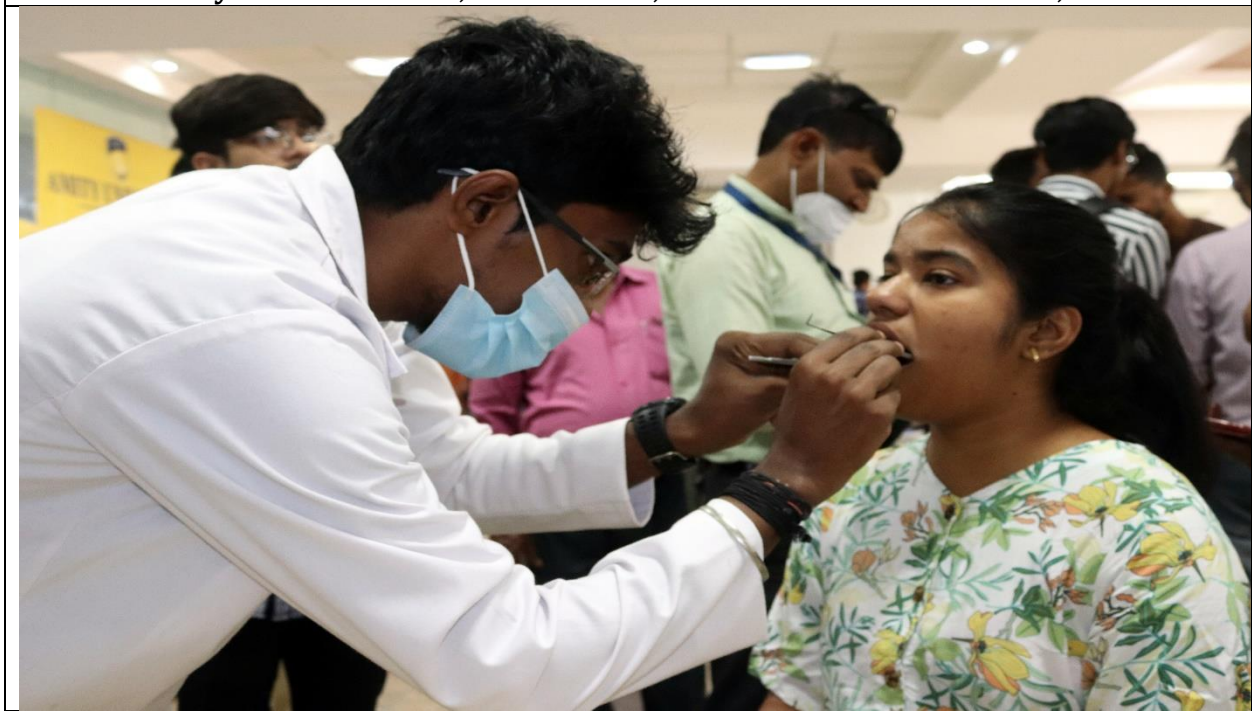
31.5.2022 Dental checkup of faculty and staff