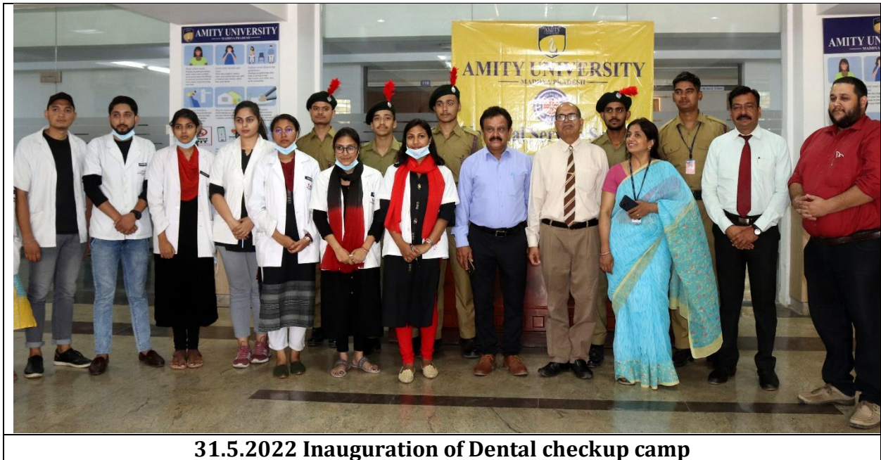
31.5.2022 Inauguration of Dental checkup camp