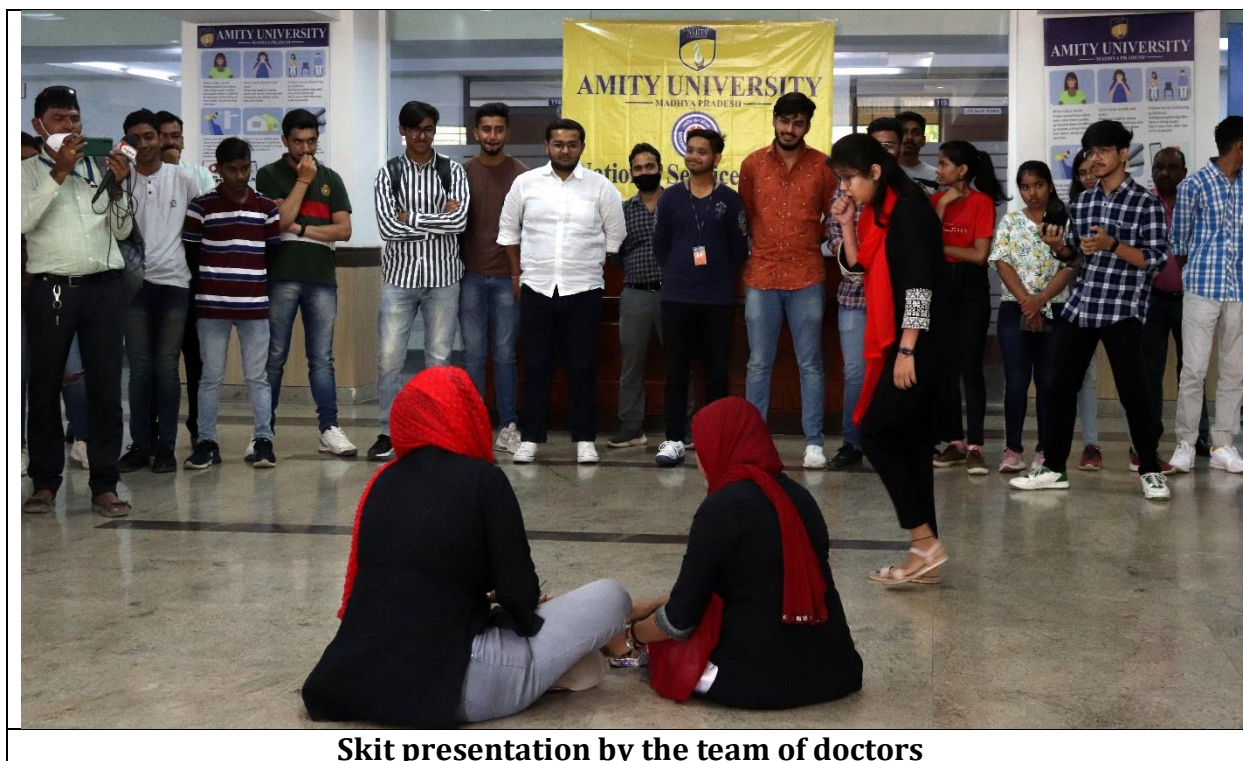
Skit presentation by the team of doctors