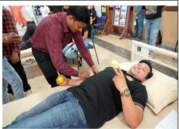
Blood Donation Camp as the First day of NSS Special Camp 2023