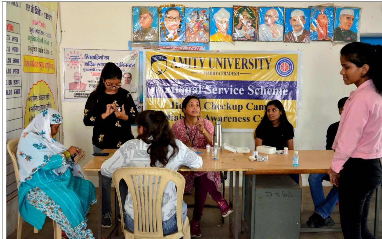
Blood Glucose Monitoring Camp at adopted village Shigora on 7.6.2022