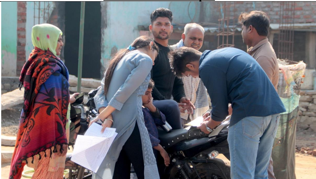
NSS Volunteers of AUMP conducting survey in Chakraipur