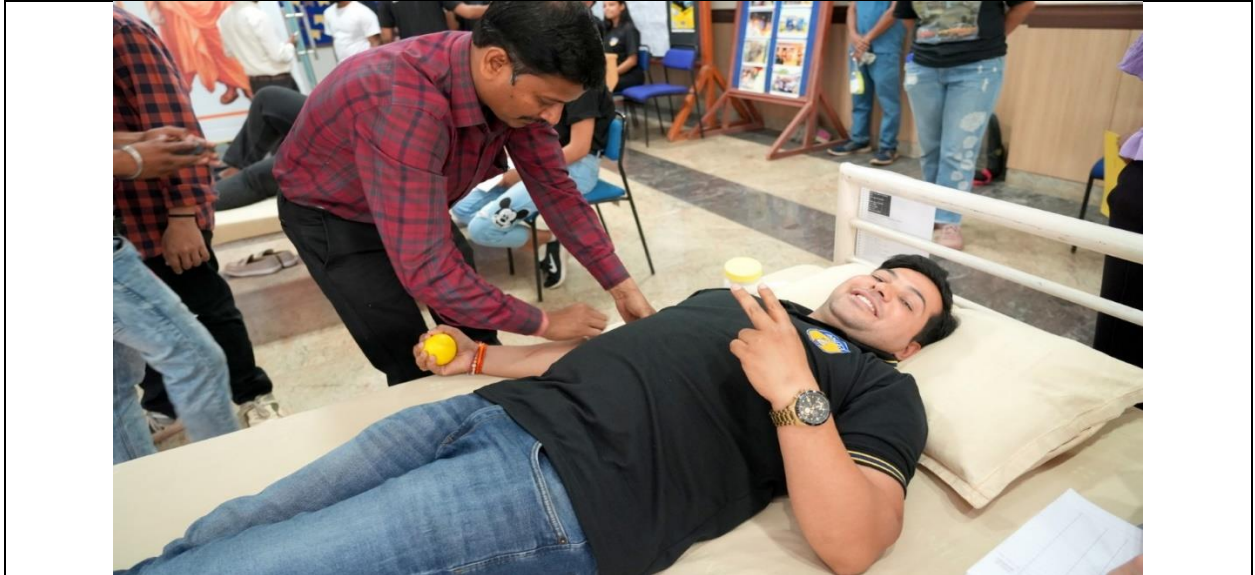
Blood Donation Drive, AUMP, 29.03.2023