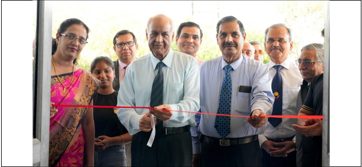
Inauguration of Blood Donation Camp, AUMP, 29.03.2023