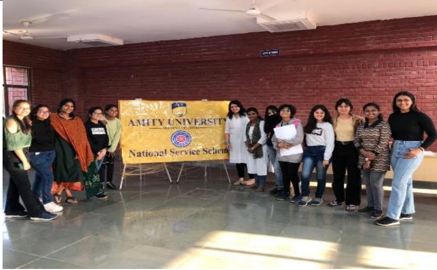
Judges viewing the models in the Trash to Treasure Competition