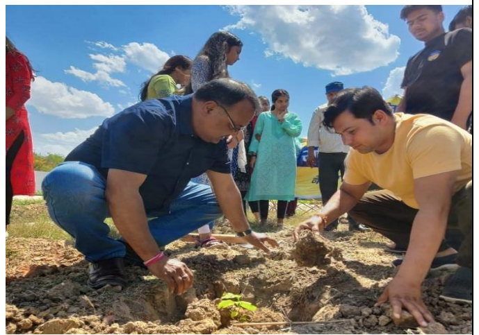
Plantation of fruit bearing perennial trees in the Ashram premises