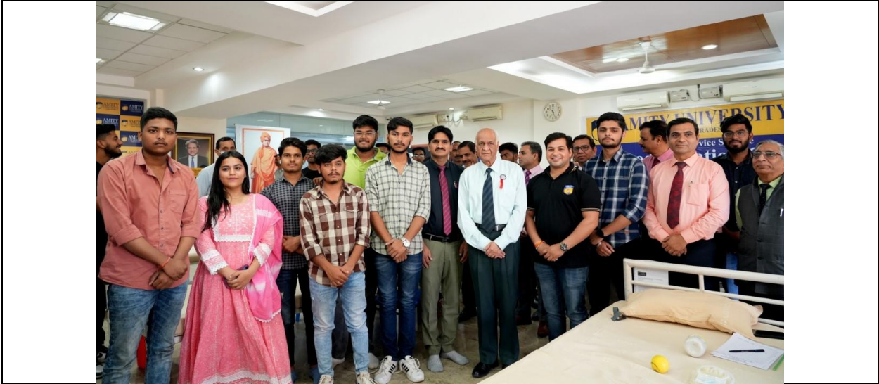
Blood Donation Drive, AUMP, 29.03.2023