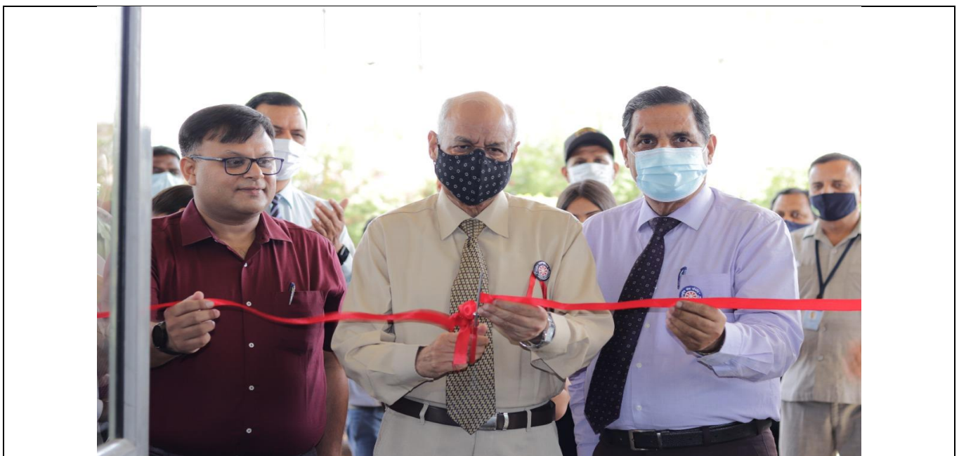
Inauguration of Blood Donation Camp, AUMP, 29.03.2022