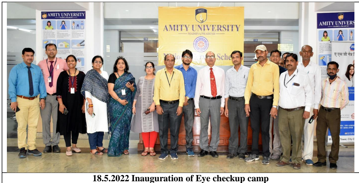
18.5.2022 Inauguration of Eye checkup camp