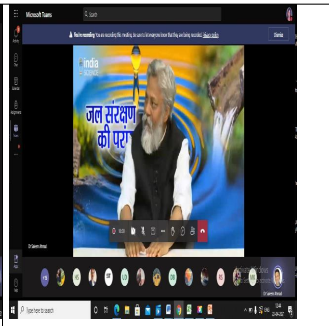
NSS Volunteers, Faculty, and Students of ASCENT/ASL/AISS attending Virtual Video Lecture of Waterman of India on MS Teams on 22.4.2021 in the 'Jal shakti Abhiyan' initiative.