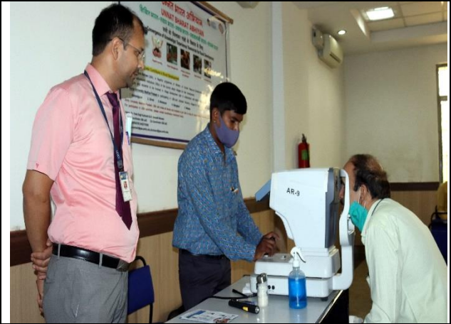
18.5.2022 Eye checkup of faculty and staff