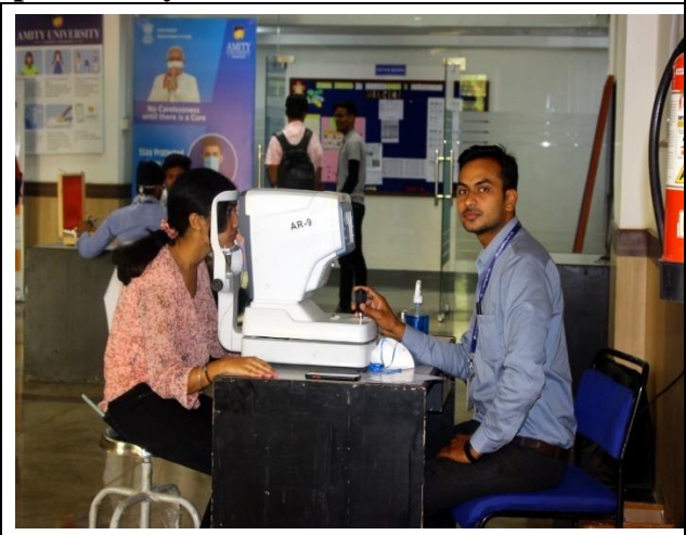
19.5.2022 Eye checkup of AUMP students