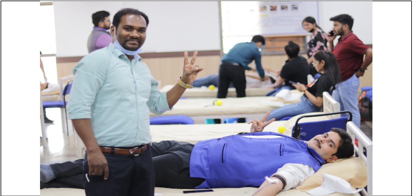
Blood Donation Drive, AUMP, 29.03.2022