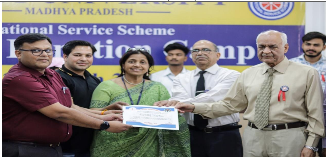
Blood Donation Camp, NSS, AUMP, 29.03.2022