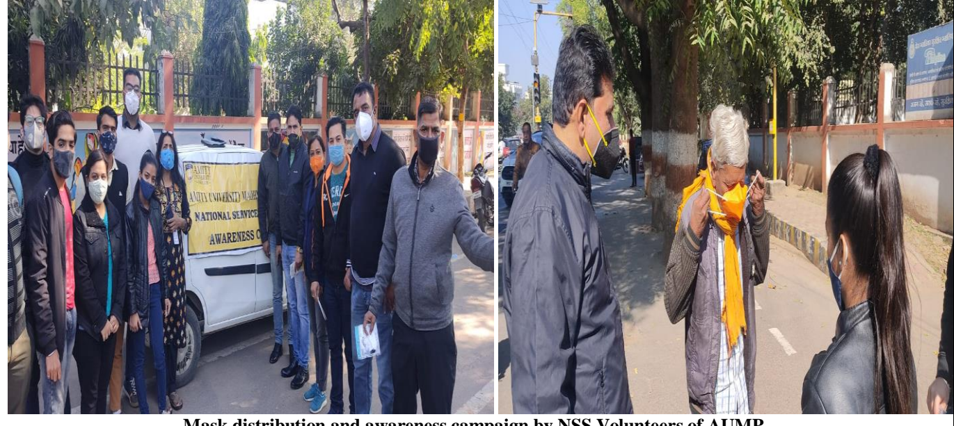
Mask distribution and awareness campaign by NSS Volunteers of AUMP