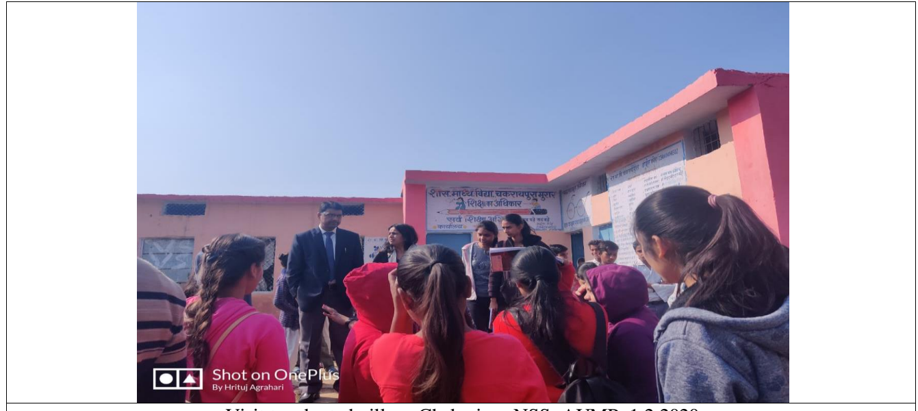
Visit to adopted village Chakraipur NSS, AUMP, 1.2.2020

Follow up activities shall be done in the AUMP campus as well as in the village Chakraipur to culminate the efforts of NSS volunteers for the benefit of the society.