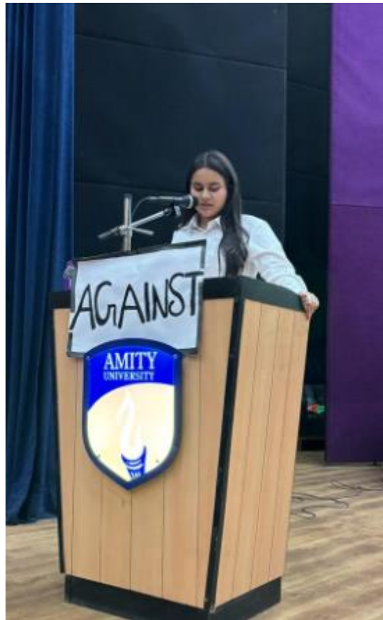
Participants presenting their views