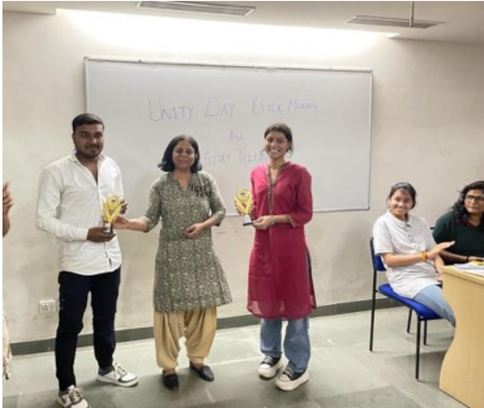
Faculty members and winners of the event posing after the competition