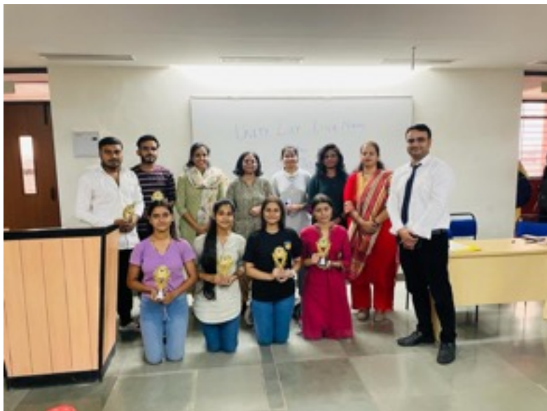
Unity Day 2023 – Promoting the spirit of unity values amongst the students of AUMP