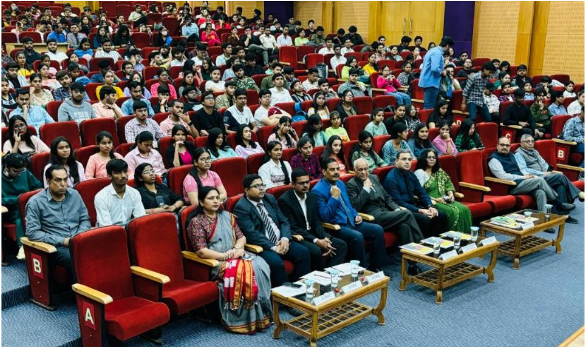
The Engaged House