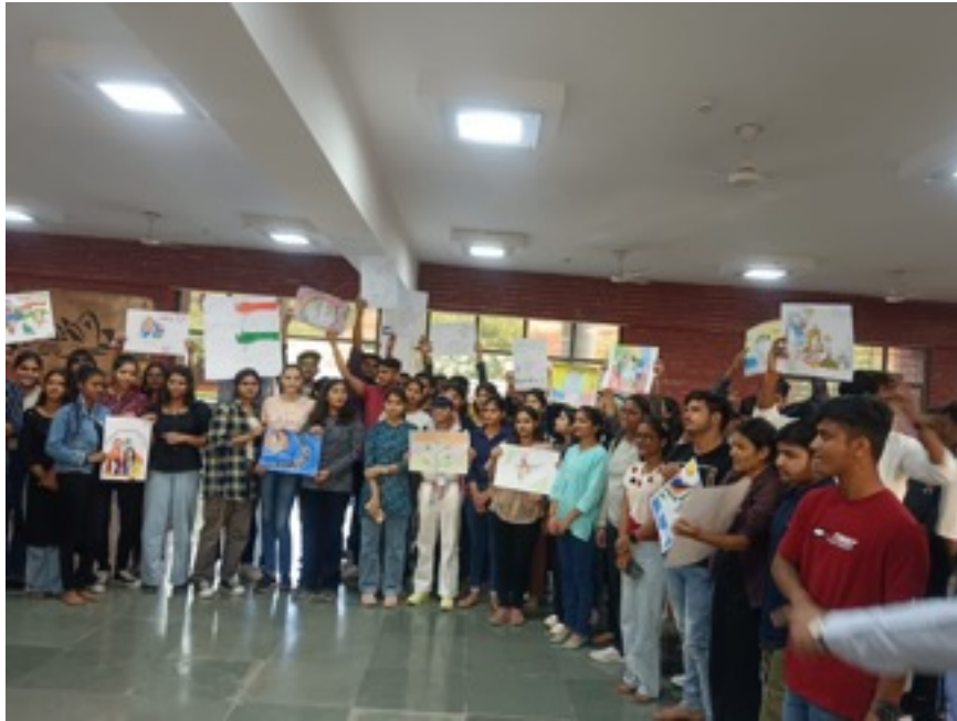
Students enthusiastically depicting the story based on unity day theme painted by them