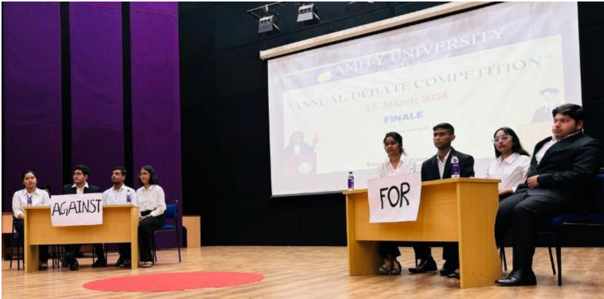
The Team A ready for their presentation