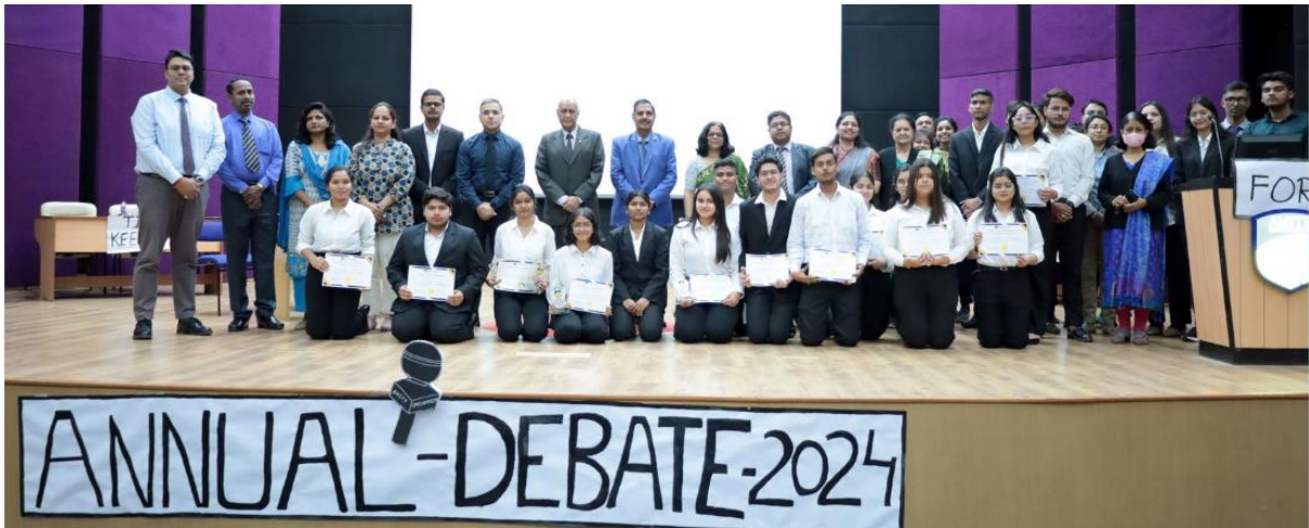
Group Photograph of the participants with the dignitaries