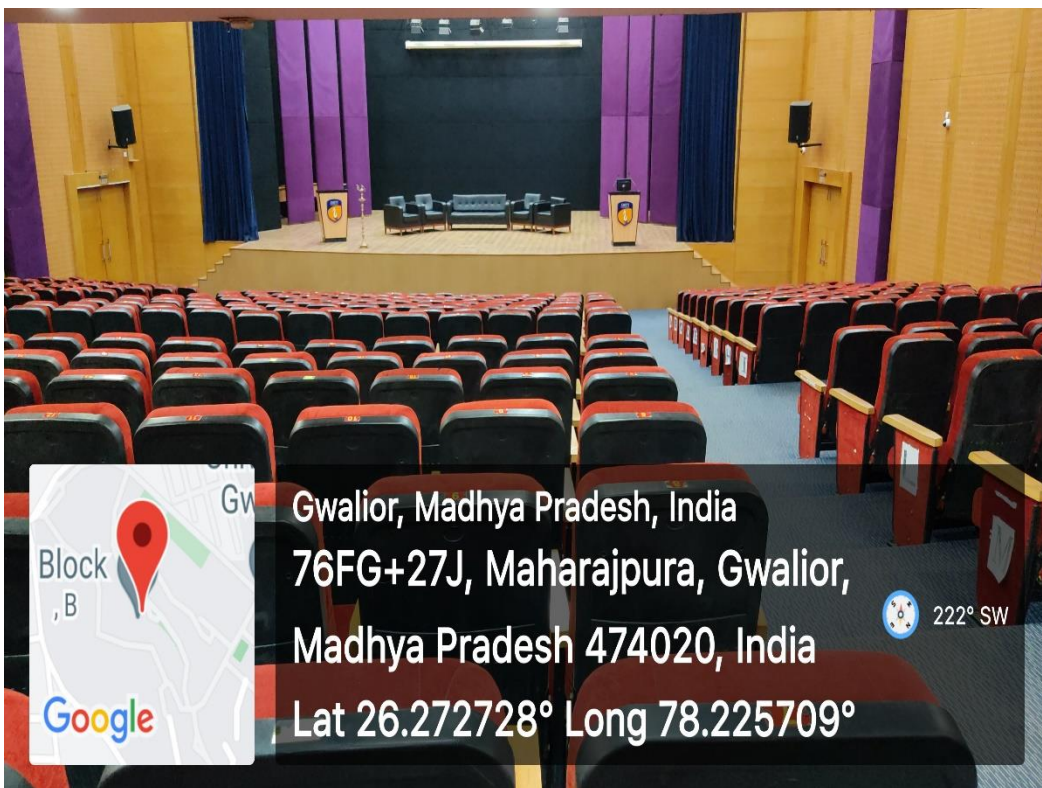
with Audio visual facilities with capacity of 610 seats