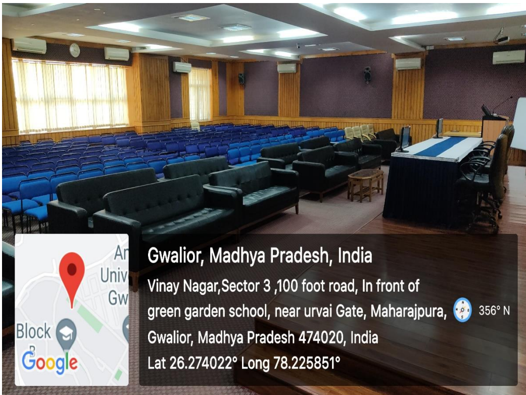
Seminar Hall Academic Block A