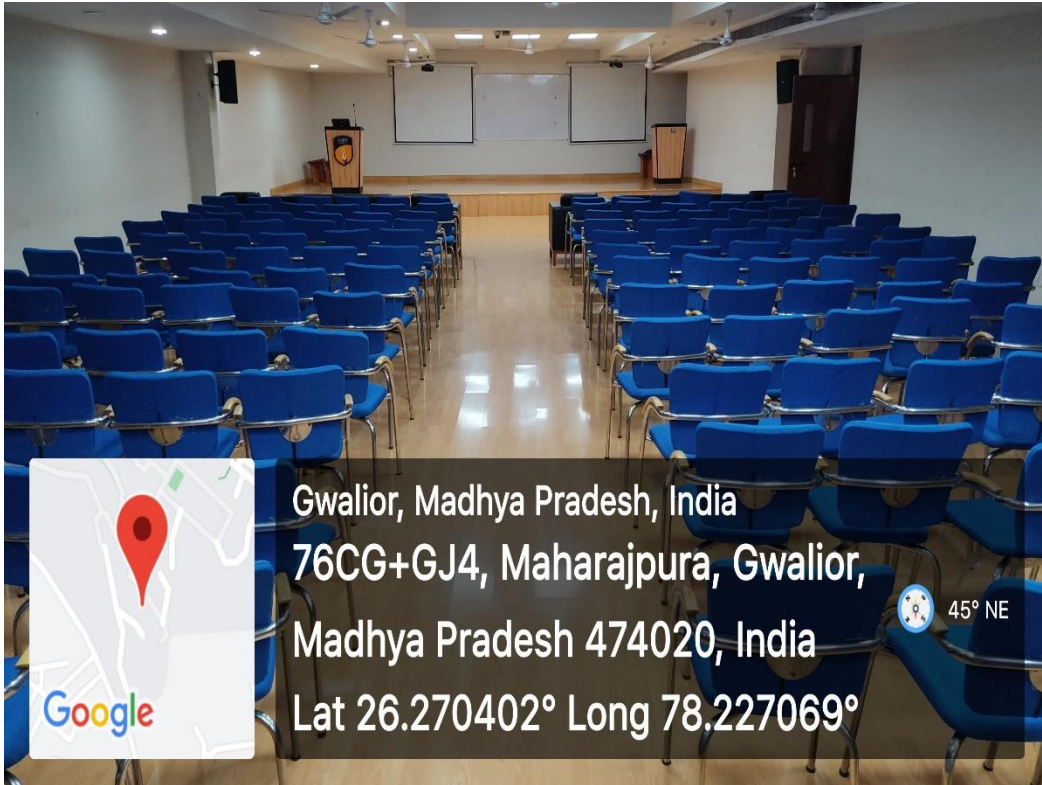
Seminar Hall Academic Block C