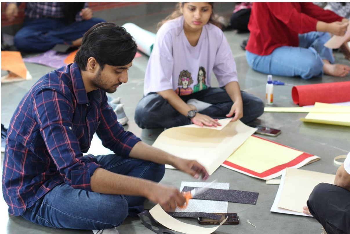
Figure-Error! No text of specified style in document.-2 Participant with their group mate working on the card making