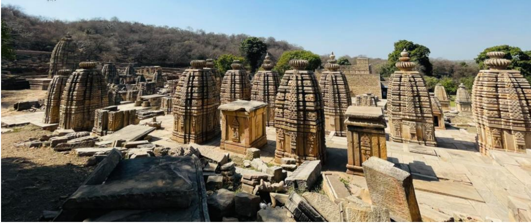
Bateshwar temples in Morena