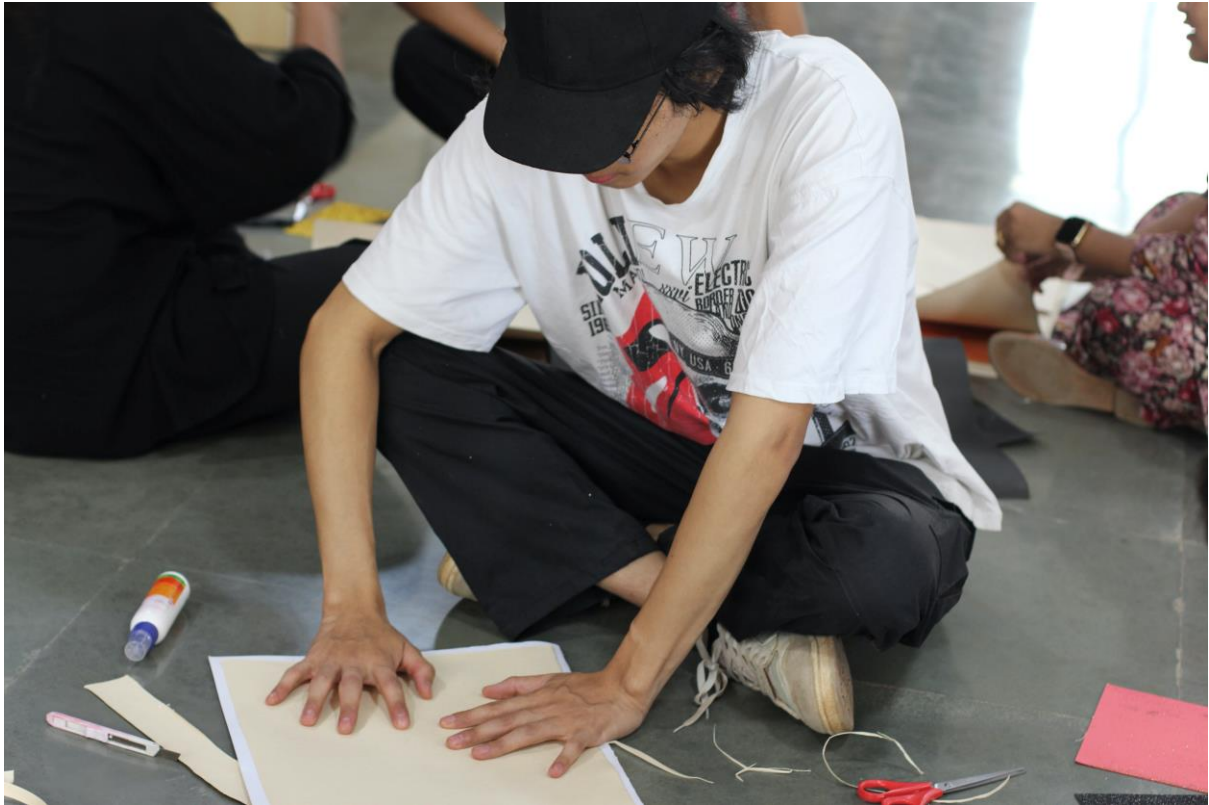
Figure -5 Participant shown good skill within the time limit and their dedication can be seen in the figure