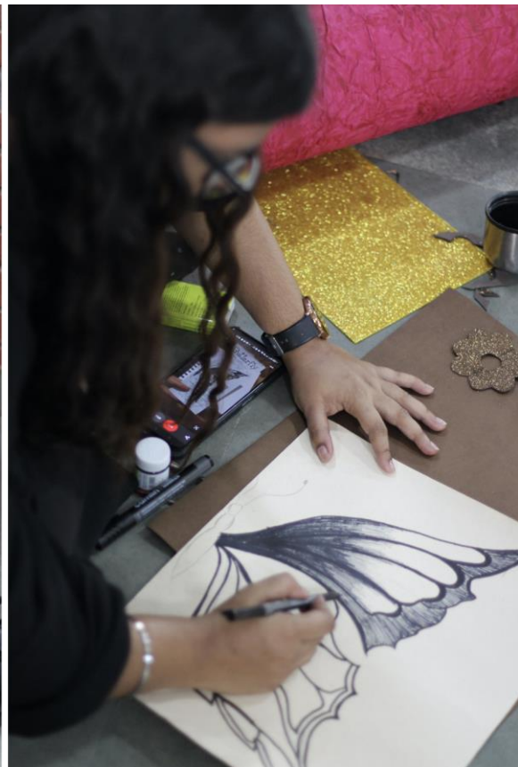
Figure -4 - Student working on different card making competitions.