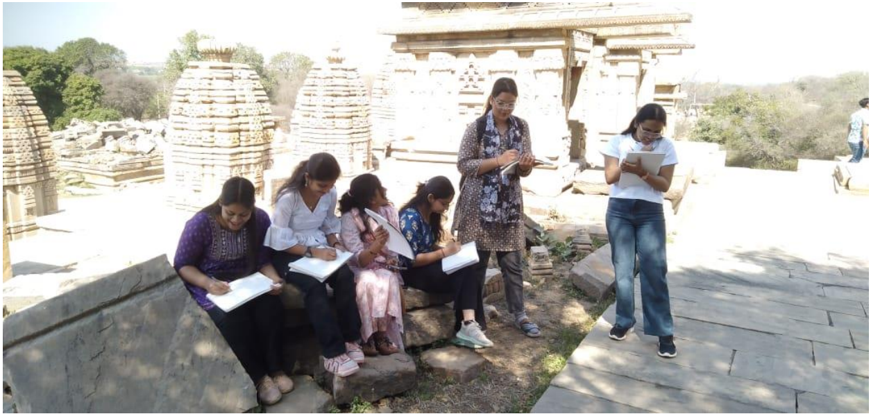
Students doing sketching during the workshop at Bateshwar.