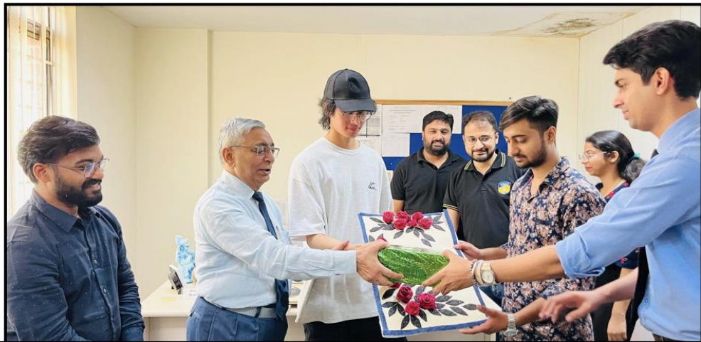
Second Position - by Kekhrietuo Chelie and Faizan - ASAP Dpt