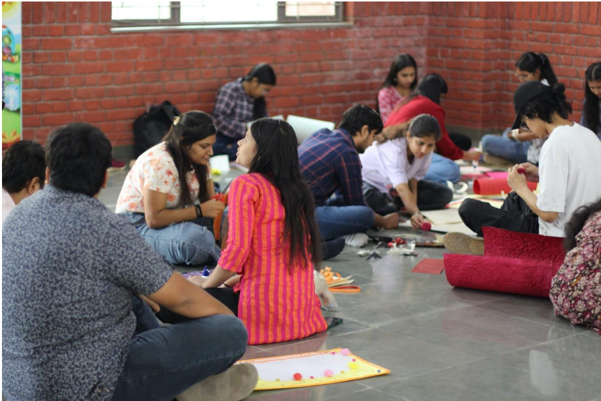
Figure -1 Participants of Various departments working on card Making Competition - Art Studio, C-Block