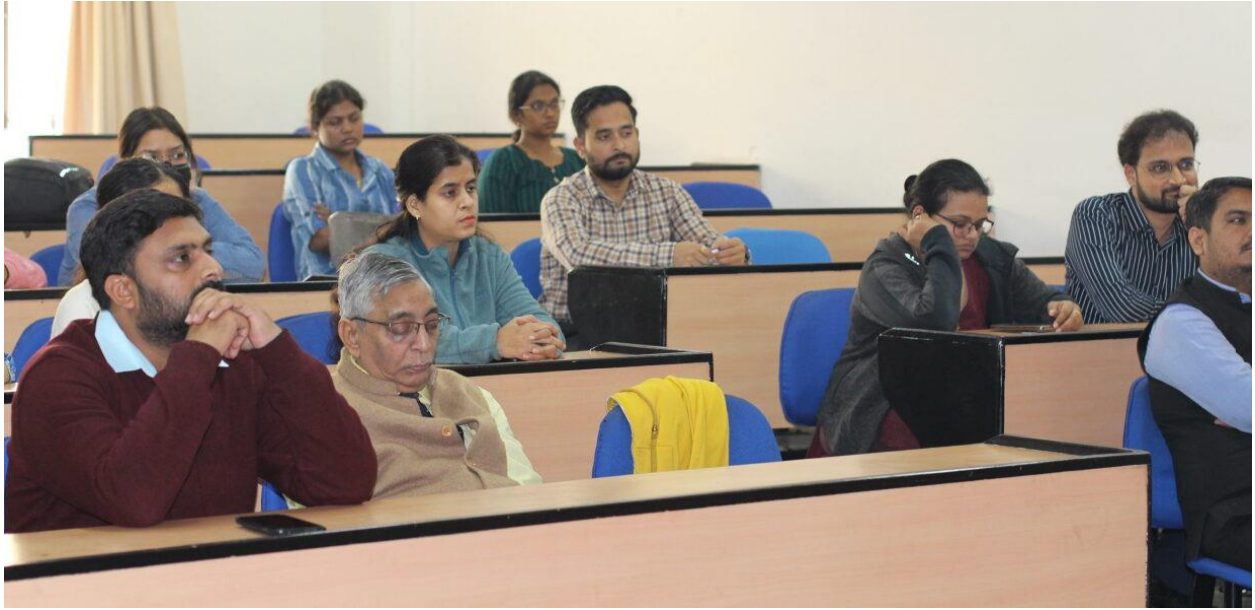
ASAP Students and faculty members during the guest lecture.