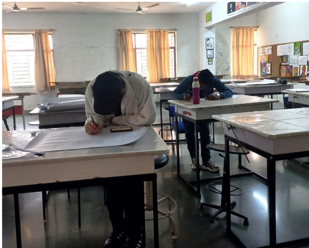
ASAP Students working on their posters during the event.