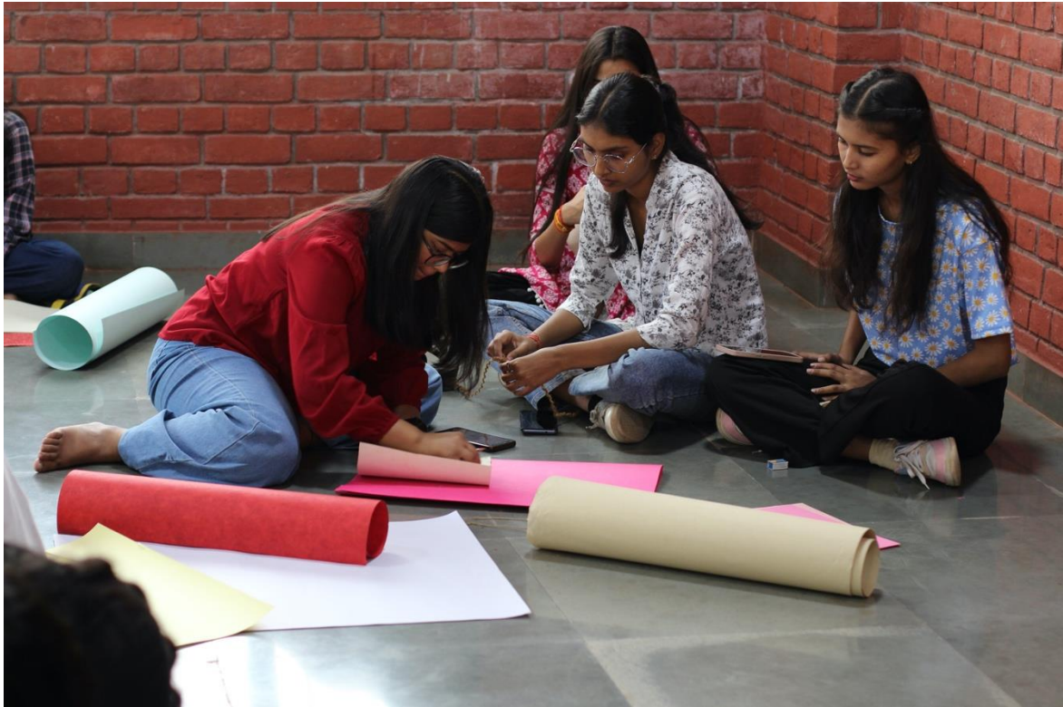
Figure -3 Participants from the AIBAS and AIP has also shown good participation and performed well