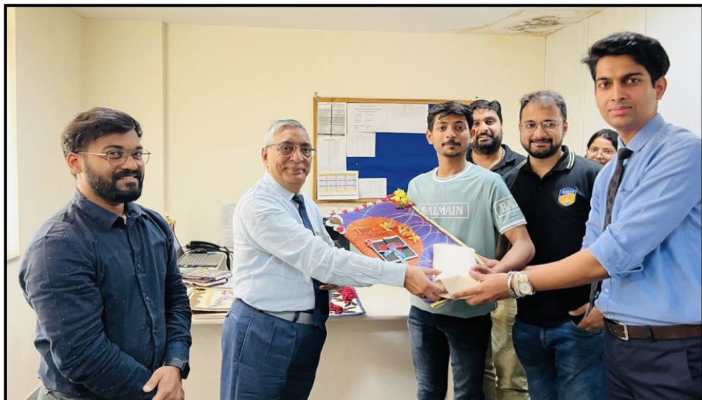
Third Position - by Deepak Mondal from the AIP department