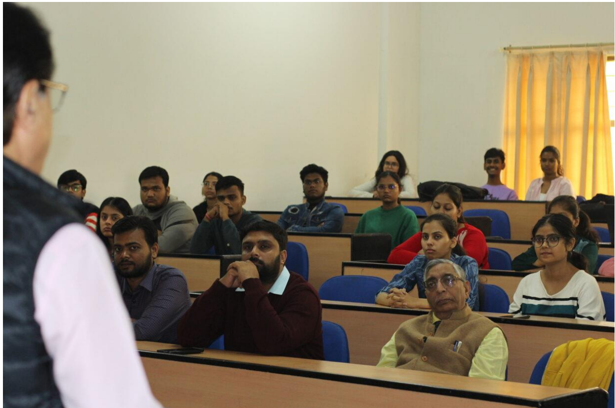
ASAP Students and faculty members during the guest lecture.