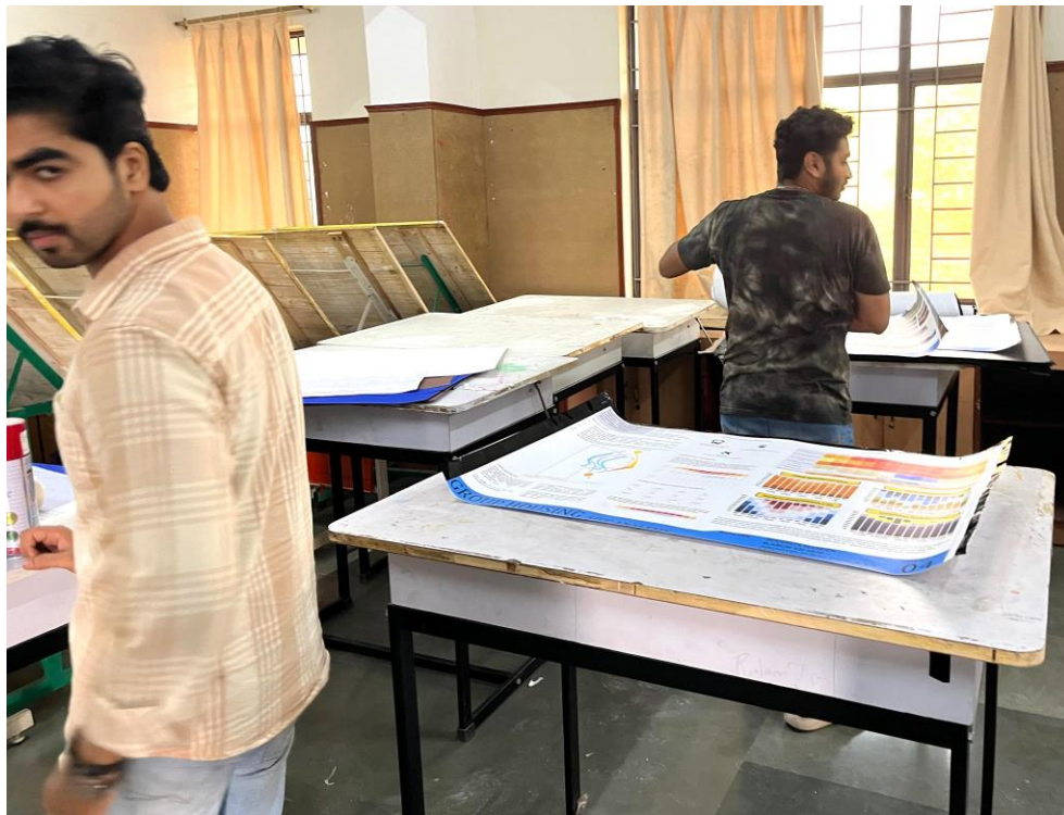
ASAP Students working on their posters during the event.