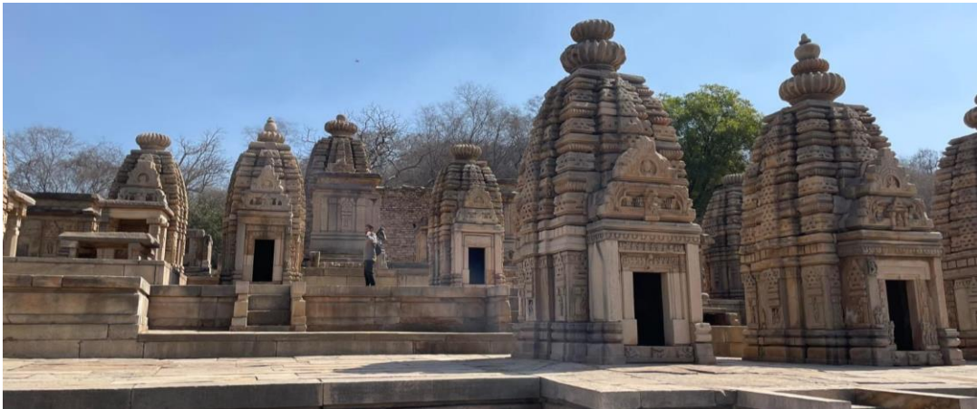
Bateshwar temples in Morena