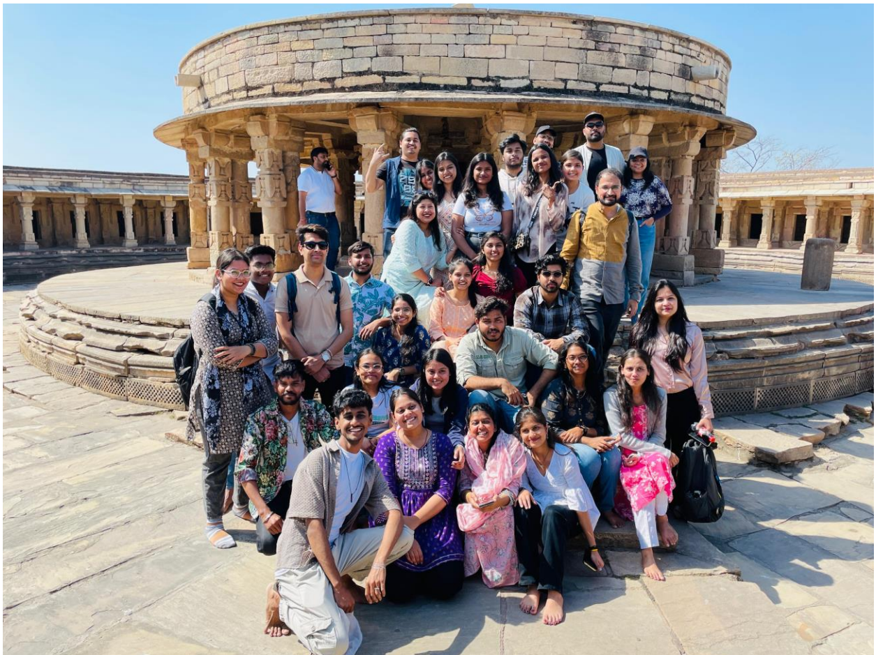
Group photo of all the participants and faculty coordinators at Mitawali.