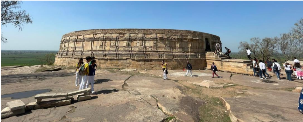
Chausath Yogini Temple, Mitawali, Morena