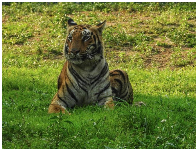
By Hiranmoy Chetia