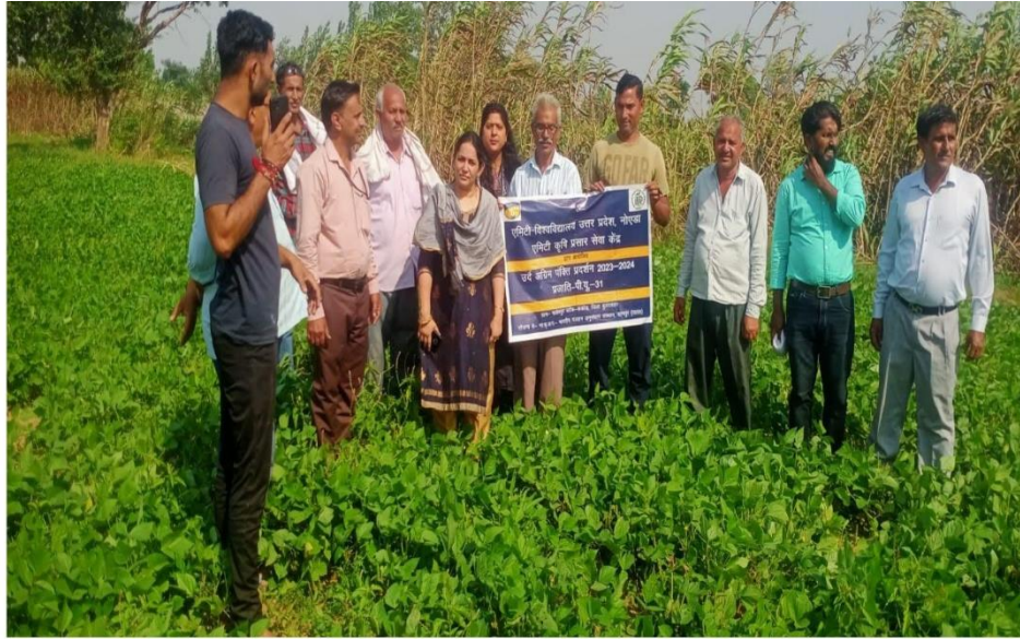
Field demonstration on Urad Bean on farmers field