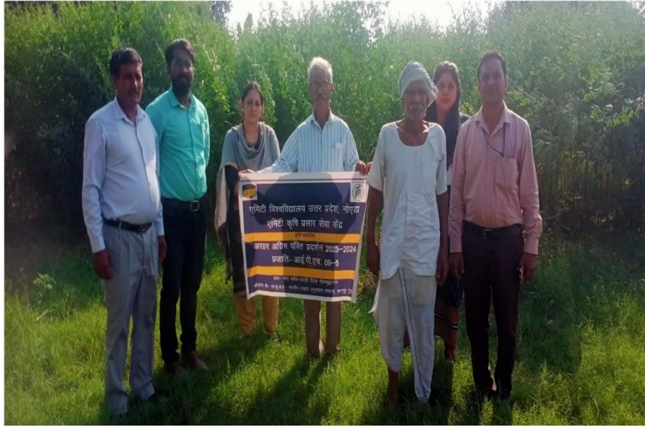
Field demonstration on Pigeon Pea on farmers field