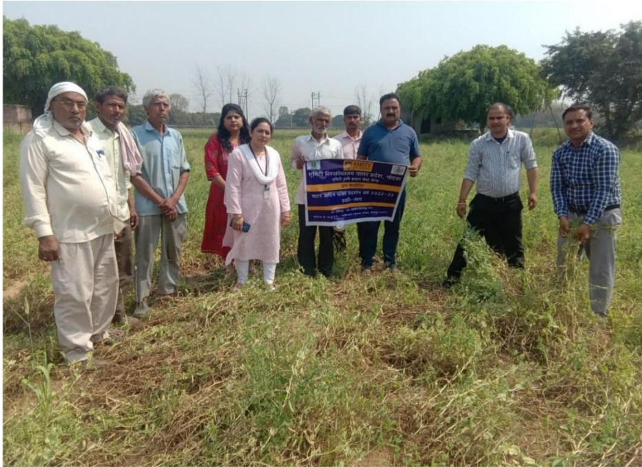
Field Demonstration on Field Pea on farmer's field