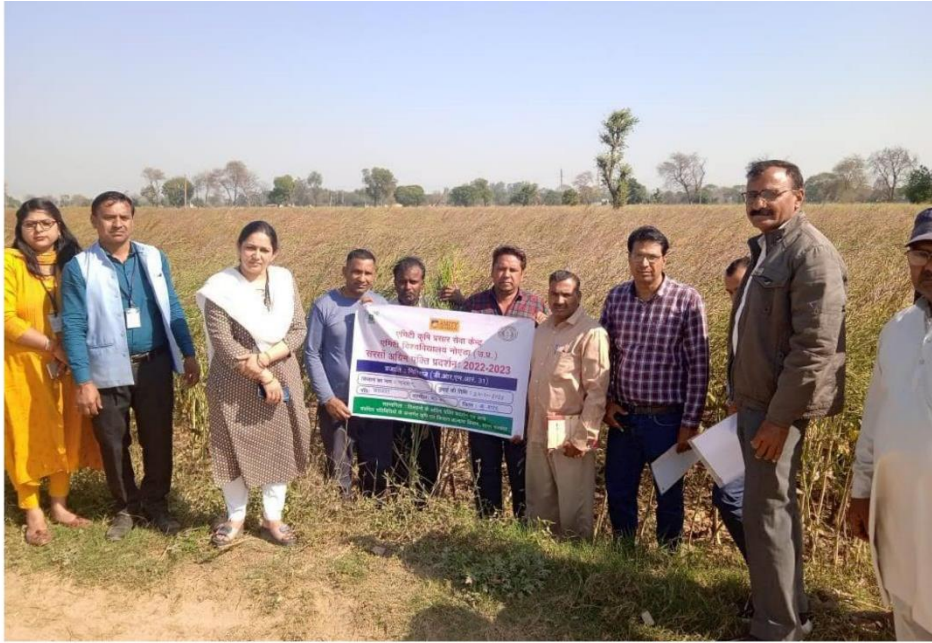
Field Demonstration on Mustard on farmer's field