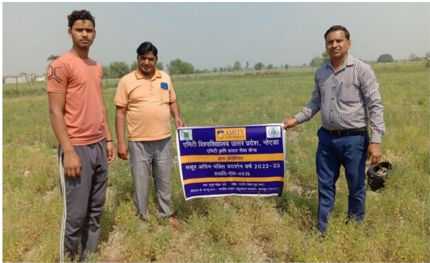
Field Demonstration on Lentil on farmer's field