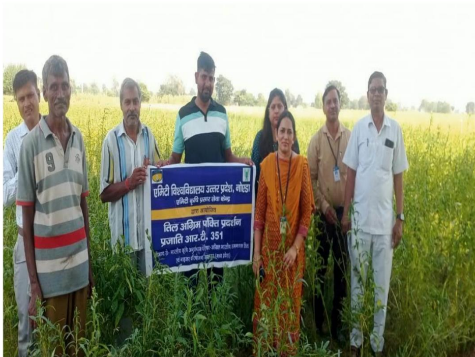
Field demonstration on Sesame on farmers field