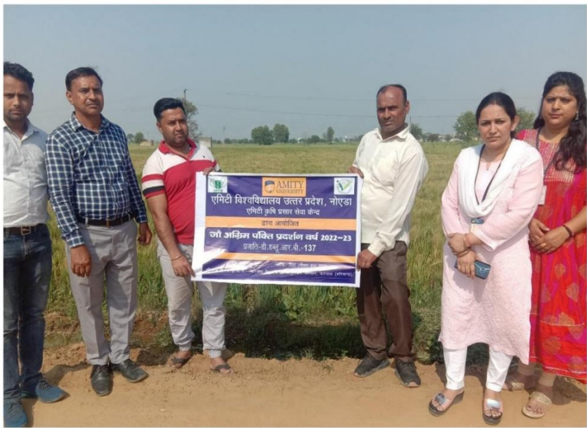
Field demonstration on Barely on farmers field