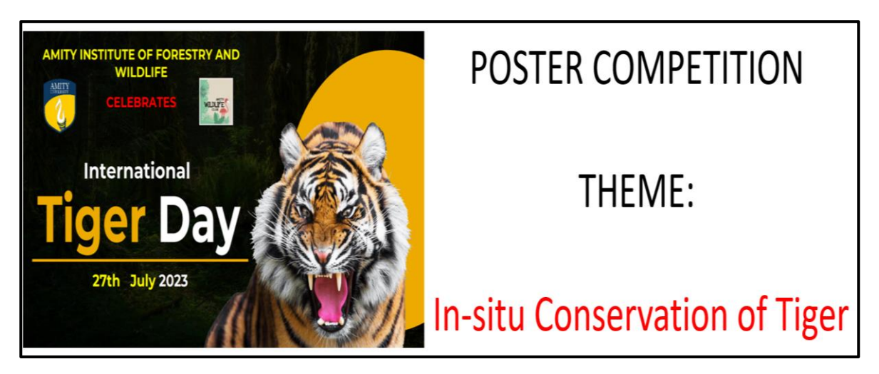
Fig 1: E-poster for the poster Competition

1. <u>Wildlife Poster Competition:</u> The theme for the wildlife poster competition was "In-situ Conservation of Tiger". 55 students from different institutions of Amity University, Noida participated in the poster competition and drew posters within the theme. Some students participated alone while other students participated in a group to make the posters. They included different aspects of tiger conservation i.e., habitat, prey, and poaching.