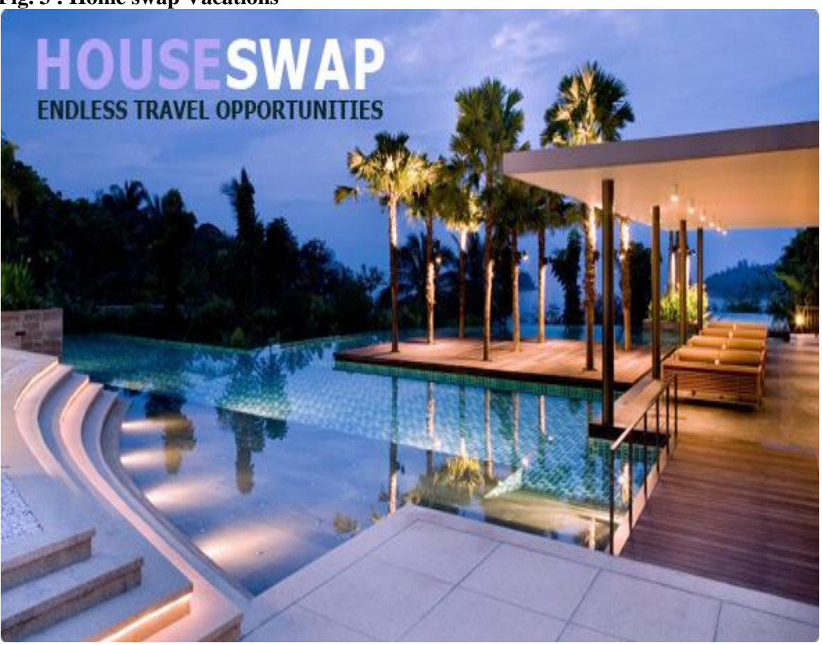
Fig. 3: Home swap Vacations

exchange exists. In contrast, commercial hospitality, with its links to infrastructure, capital owners, and hoteliers, should be understood in sharp contrast with a non-commercial hospitality.