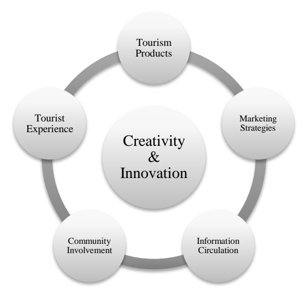
Figure 4: Creativity and Innovation as a Key Tool for City Tourism

The first and the foremost requirement for developing city tourism are Creativity and Innovations. The below mentioned figure describes how using creativity and innovation can brings changes in the growth and development of City tourism-