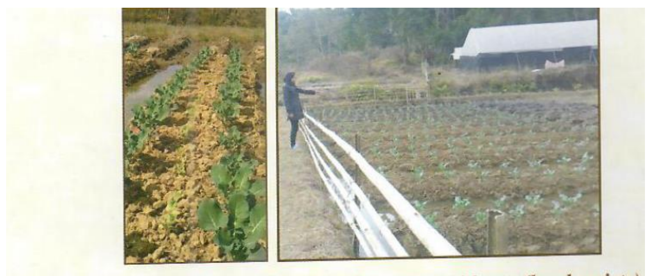
Intercropping of broccoli (variety Ashwarya) with pea (local variety)