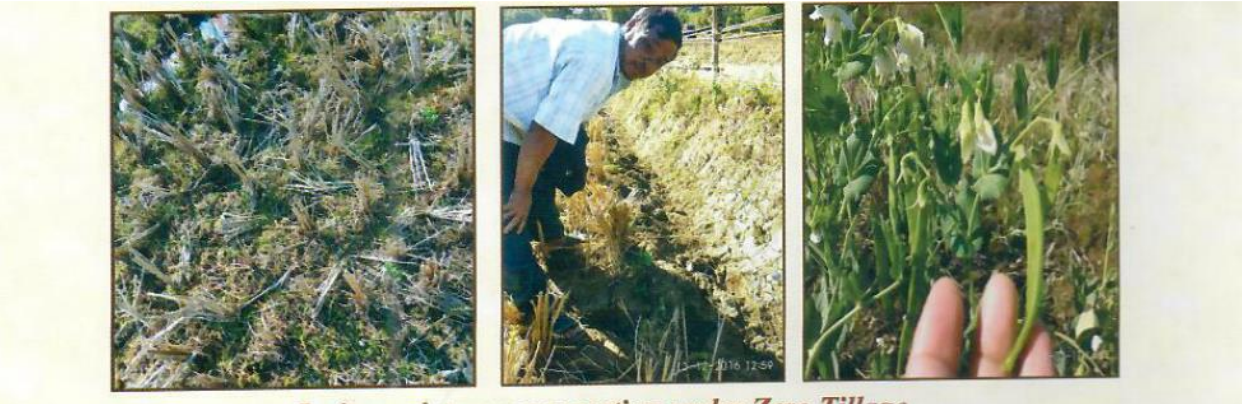
Insitu moisture conservation under Zero Tillage

Sponsored/Competitive Grants. Here we share some of the success stories of NICRA taken from NICRA