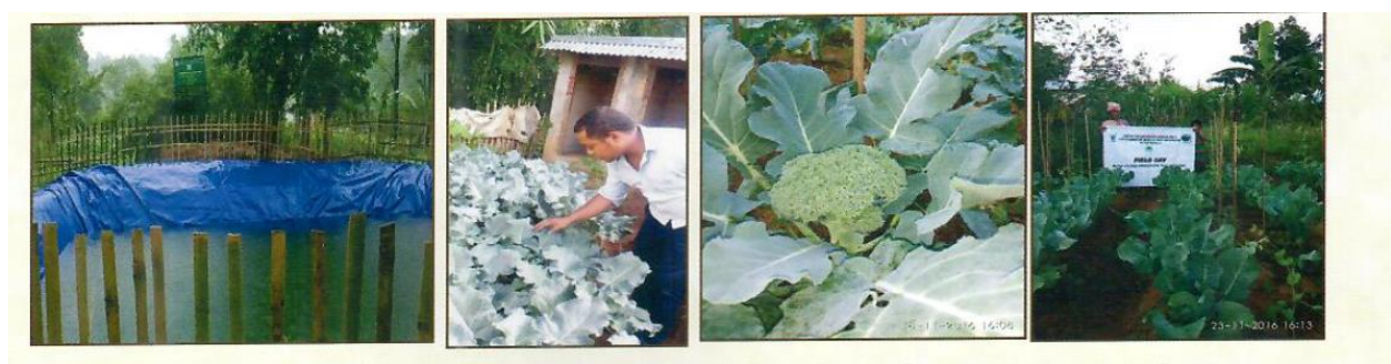
Low cost water harvesting structure -Jalkund/ Vegetable cultivation during Rabi Season