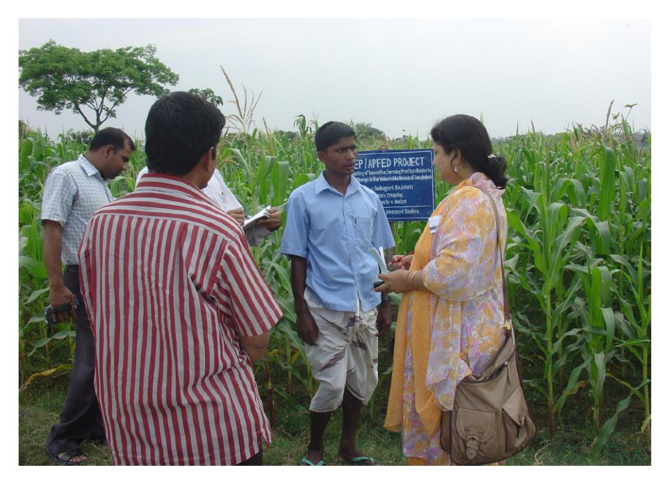
Farmer explaining the Relay Cropping of Tomato and Maize