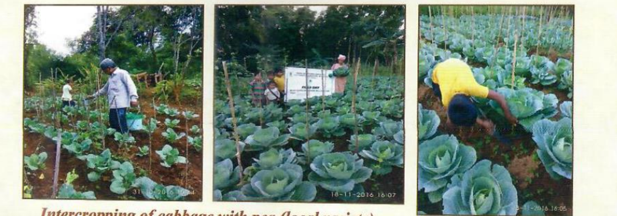
Intercropping of cabbage with pea (local variety)