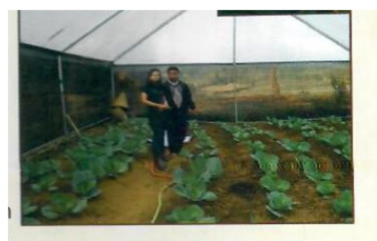
Year Round Vegetable Production