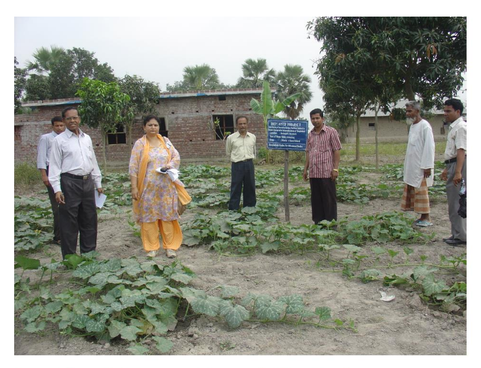
Positive Effect of Relay Cropping on Crop growth of Sweet Gourd