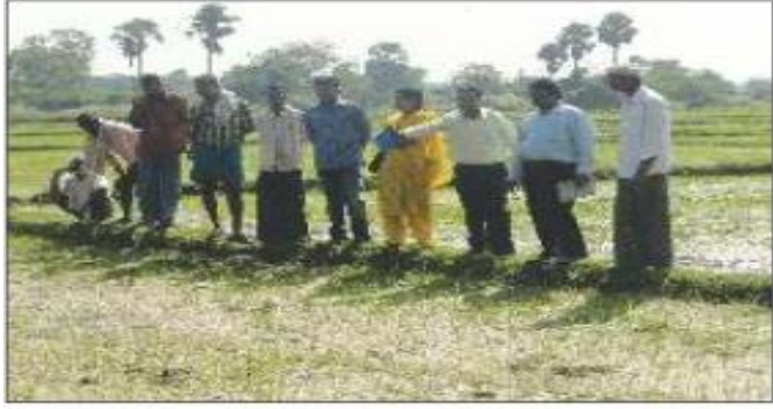
Observing crop stand few days after seeding