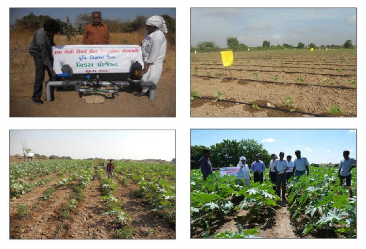
Low cost Checkdams and Drip Irrigation