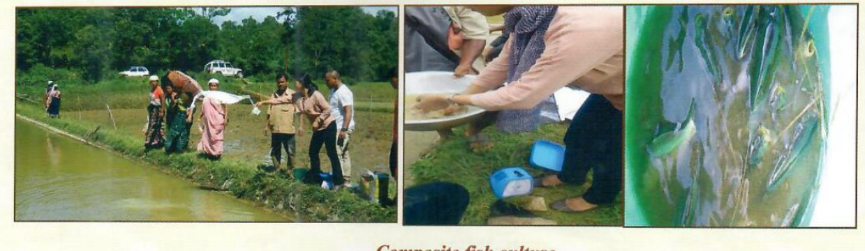
Composite fish culture