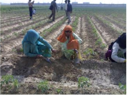
Training of the decision maker ultimately benefit women laborers