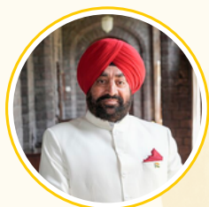
Lt. Gen. Gurmit Singh (PVSM, UYSM, AVSM, VSM) Hon. Governor, Uttarakhand