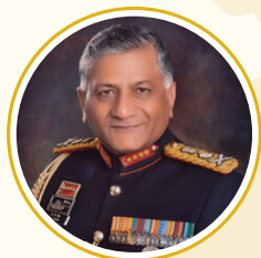
Gen. V K Singh (PVSM, AVSM, YSM, AD) Former COAS, Former Minister of State for External Affairs