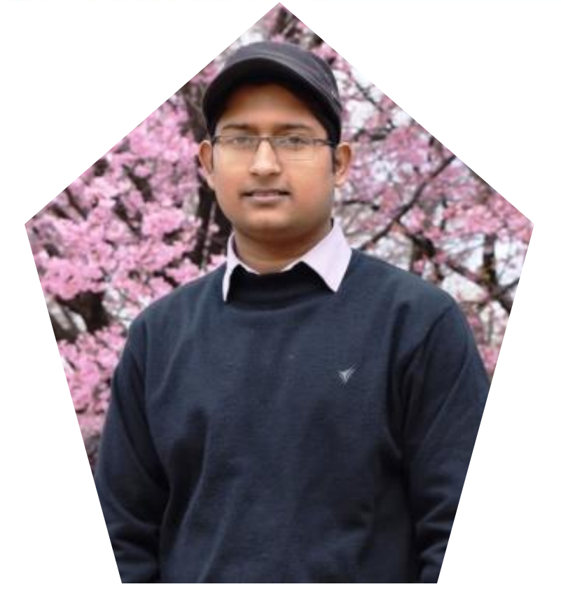
Ecole Polytechnique federale de Lausanne (EPFL), Sweden (Max Plank Institute)

1 had a great 2 years' experience while doing my M.Sc in Applied Physics from Amity University. Very supportive faculty and always open for constructive suggestions and changes. Although rules and regulations are very strict, but there is always room for a genuine and positive scientific endeavour. I am exceptionally convinced that the ease at which I could implement few changes (e.g. signing an MOUWith RIKEN, Japan for my scientific tour) would never have been possible so easily in even the topnotch universities in the country.