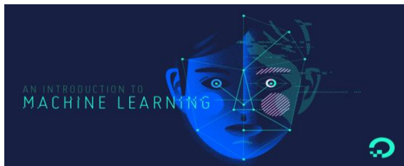
Fig. 1. Machine learning concept.

Machine learning (ML) is a field of study that may allude to computers learning from past understanding (past information) to enhance future execution. The main focus of this field is the ability of machines to use programmed learning techniques. Learning alludes to understanding or studying changes with reference to past encounters.