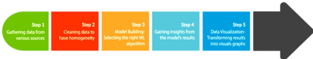
Fig. 3. Machine Learning Workflow