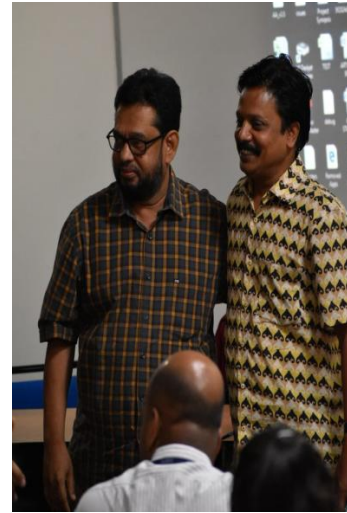
Felicitation of Guests