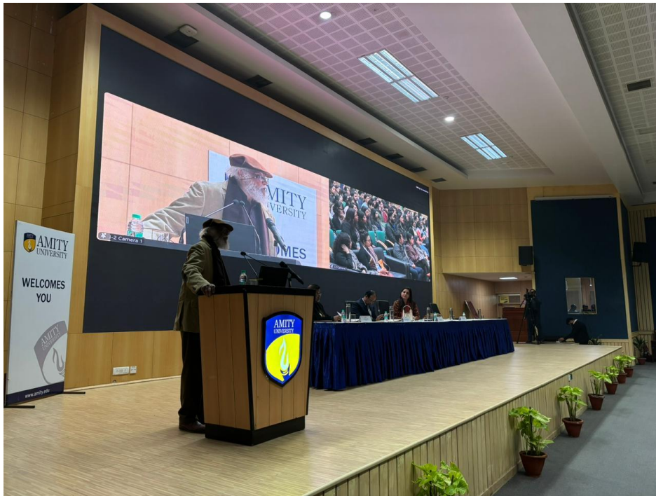
Jatin Das: Bridging Art, Culture, and Creativity

Jatin Das, the legendary artist and founder of the JD Centre of Art, shared his vision of preserving India's rich cultural heritage through art. He discussed his 40-year collection, including over 6,000 hand-fans, and encouraged students to connect with nature. He highlighted how art and science are interlinked and emphasized the importance of finding rhythm in the everyday world around us. He also discussed his projects, including capturing migrant workers' struggles in "Exodus 2020."