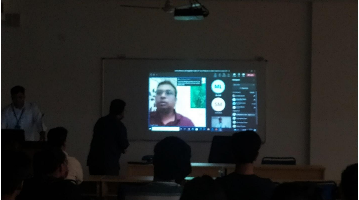
(Industry Speakers Interacting with the students of UG)