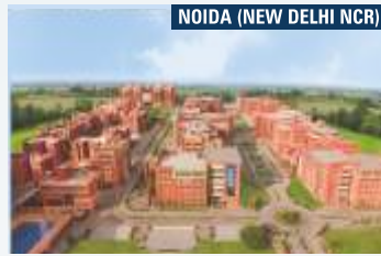
NOIDA (NEW DELHI NCR)