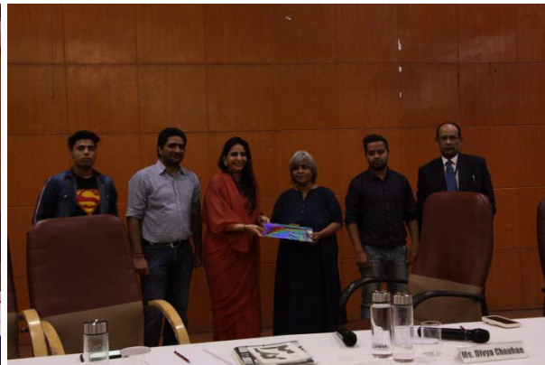
Facilitation of Dignitaries of Seminar