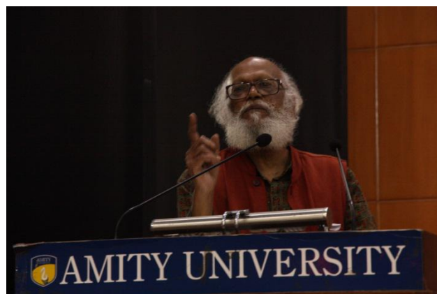
Padma Bhushan and Eminent Artist Jatin Das delivering key note address

Sharing his happiness in visiting educational institutions like Amity, Padma Bhushan and Eminent Artist Jatin Das shared with the students how we have inherited, decadent colonial academic system. "This system advocated a divide between Science and Art while in reality there is no divide. I request all academic institutions to combine science and art as there is nothing like art without science and vice versa," shared the eminent artist. Asking students to be adaptive to learning everything, Shri Das asked the institutions to focus on giving students and exposure to experiences. "Art should not be confined to your art department only. Institutions should give students training after they have experienced every nuance. I would suggest that don't think of jobs right from the beginning. Take a year off and travel. You need to form and interest first," shared Shri Jatin Das.