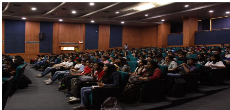
Students of ASFA attending seminar