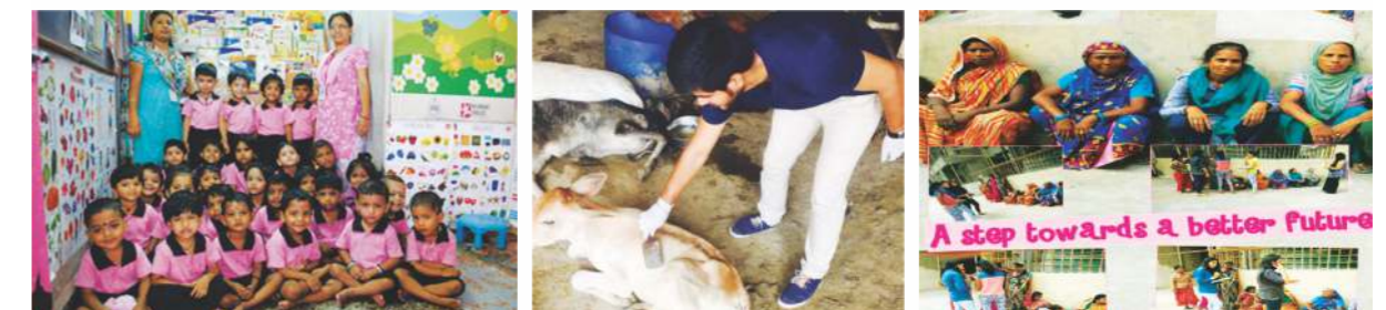
Glimpses of Activities in Odd Semester and Even Semester 2015-16 Human Values and Community Outreach Course