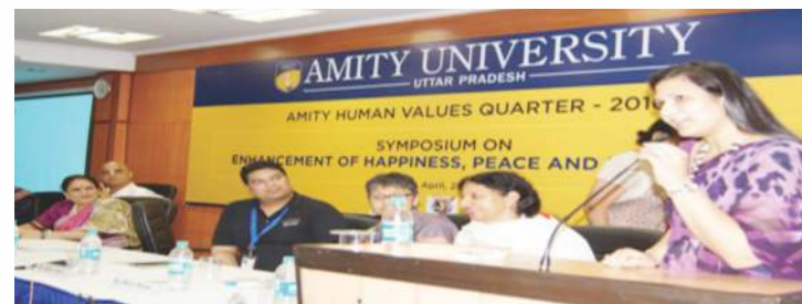
Symposium on "Enhancement of Happiness, Peace & Prosperity" Amity Human Values Quarter 2016