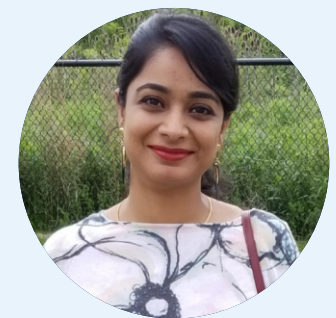
Ms. Avneet Kaur