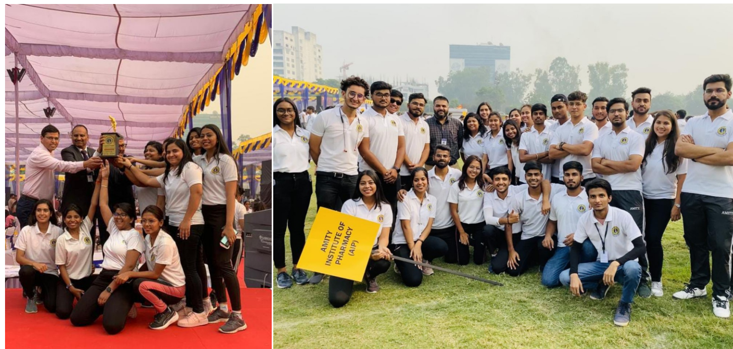
Pharmacy Girls Cricket team winning Gold medal in Sangathan 2023