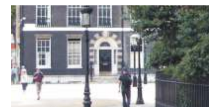
AMITY UNIVERSITY [IN] LONDON