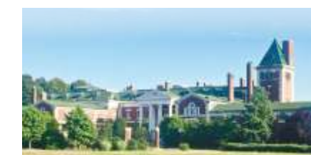
AMITY NEW YORK