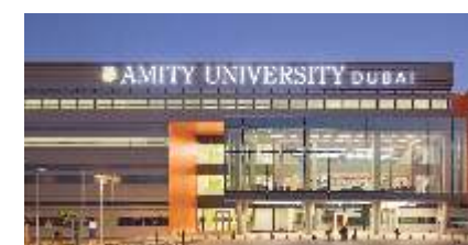
AMITY UNIVERSITY DUBAI

The Study Abroad Programme enables Amity Students to gain valuable international experience at Amity campuses in Dubai, Singapore, London & New York. This unique programme spanning 4-6 weeks adds real value to students in the form of international experience and gaining a global perspective, and also enhances their resume for better career opportunities.