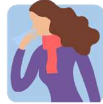
Congestion or runny nose