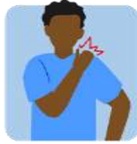
Muscle or body aches