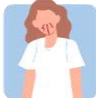
New loss of taste or smell