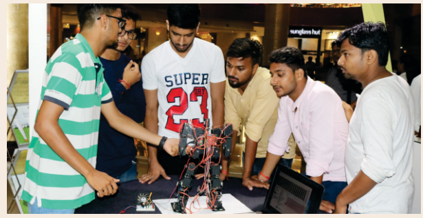
Student Innovative Project - Humanoid

Amity University Rajasthan has established interdisciplinary practices, research and outreach centers. These hubs of future-focused innovation are driven by Amity's faculty & scientists, who are exploring blazing new paths of success in various cutting-edge areas of science and technology. Some of the students' innovations include F-1 Car, Drone, Humanoid, All-Terrain Vehicle, Electric Bamboo Bicycle and Smart Shoes.